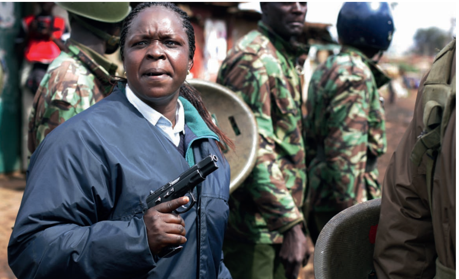
Police officer on duty during protests in Nairobi, Kenya, January 2008.