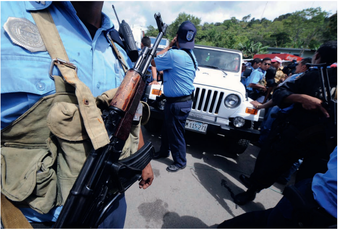
Armed police protect the vehicle carrying Honduran president Manuel Zelaya, Las Manos, Nicaragua, July 2009.

India). In a few countries and territories, only select officers can be armed (for example, England and Wales).