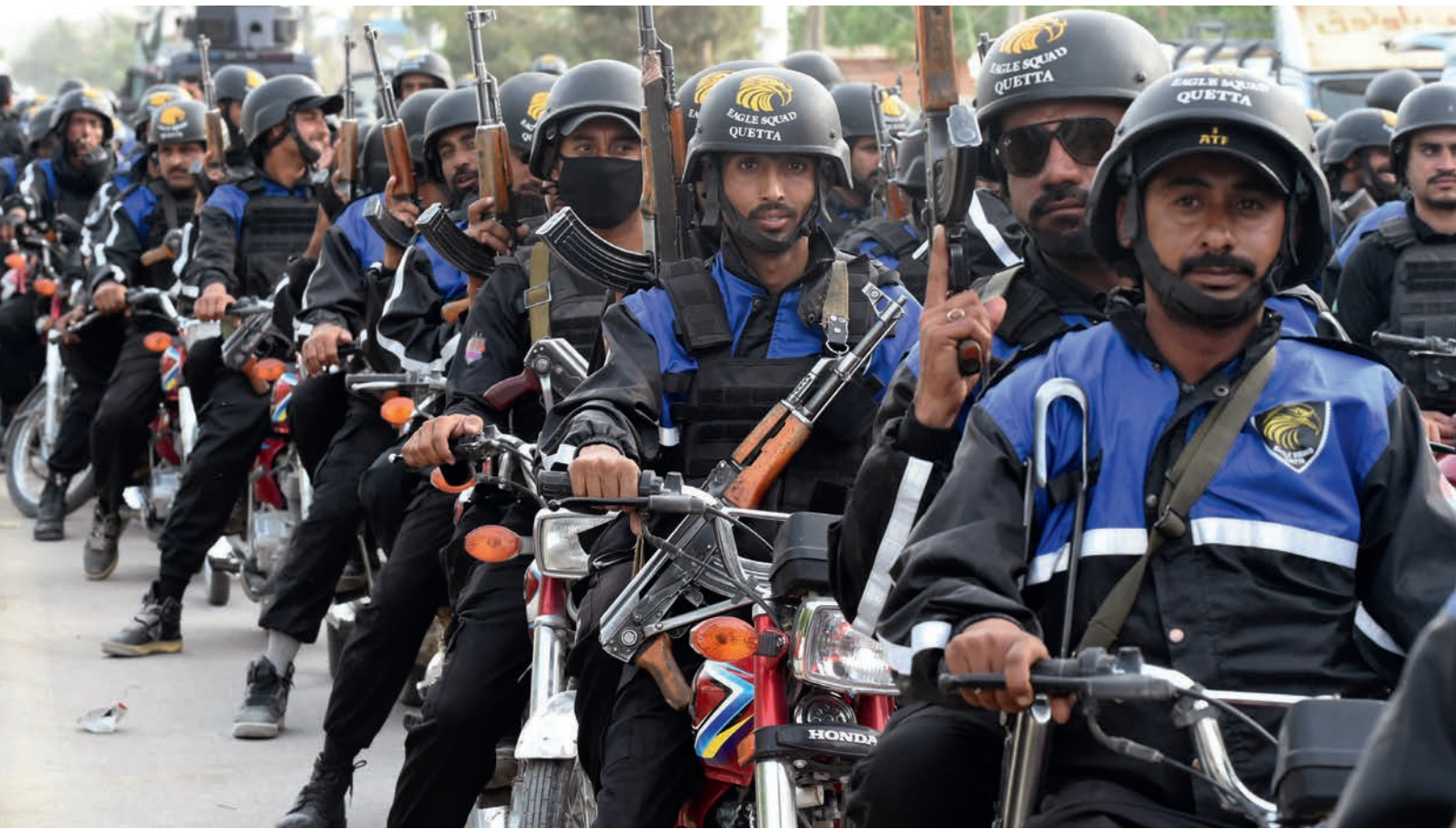
Pakistani members of the police force, 'Eagle Squad', on patrol in Quetta, Pakistan, May 2018.

evaluating country totals or comparing law enforcement agencies include the following: