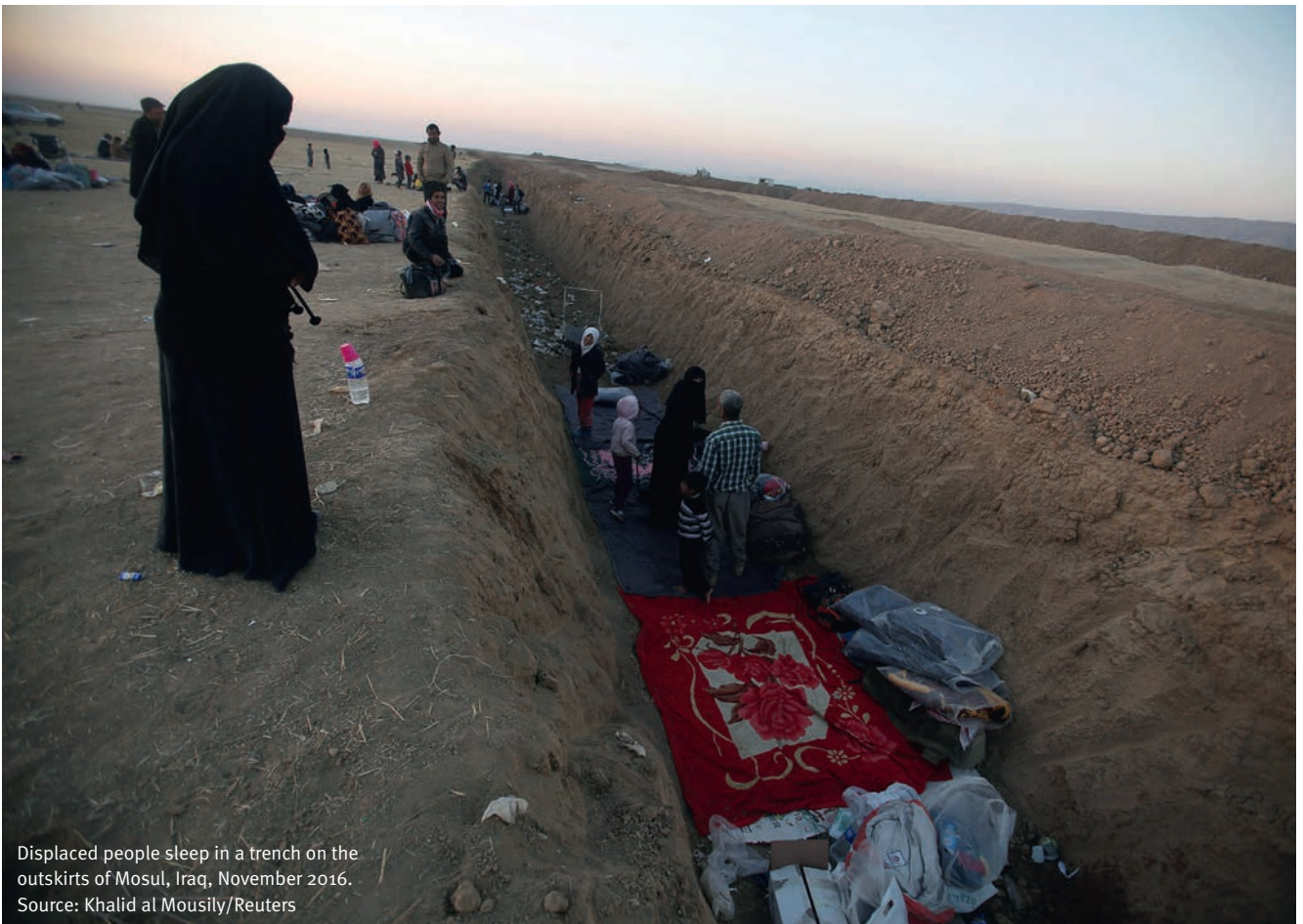
Displaced people sleep in a trench on the outskirts of Mosul, Iraq, November 2016.

unprecedented progress’ (Wise, 2017, p. 139). Indeed, suitably targeted remedial actions—such as vaccination campaigns, food distributions, and improvement of water and sanitation services—regularly prevent people in conflict-affected regions from dying. Nevertheless, lives continue to be lost wherever such interventions are inadequate, arrive too late, or fail to materialize.