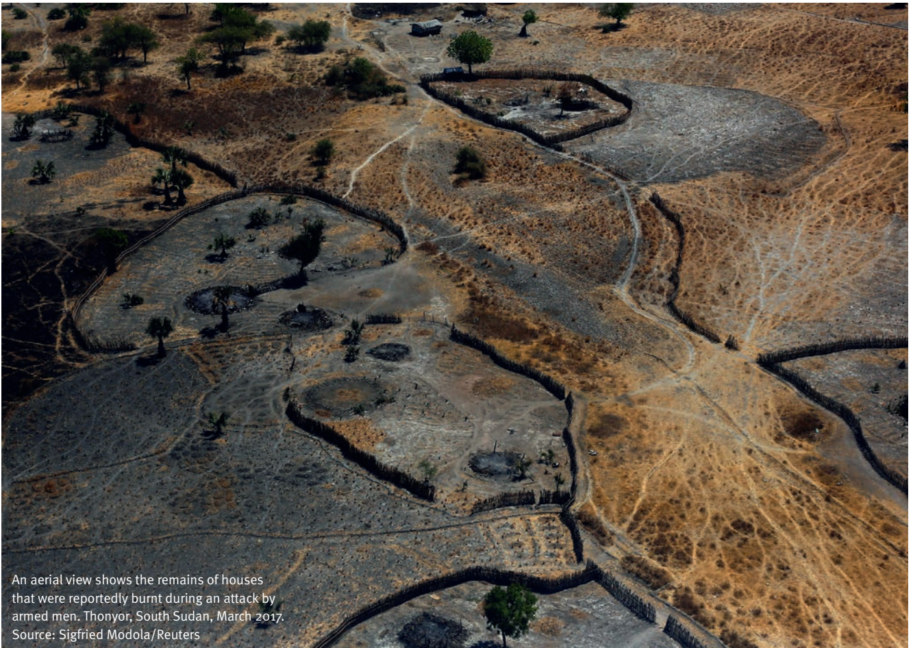
An aerial view shows the remains of houses that were reportedly burnt during an attack by armed men. Thonyor, South Sudan, March 2017.

average ratio of four indirect deaths for every direct death as a conservative global estimate (p. 42).