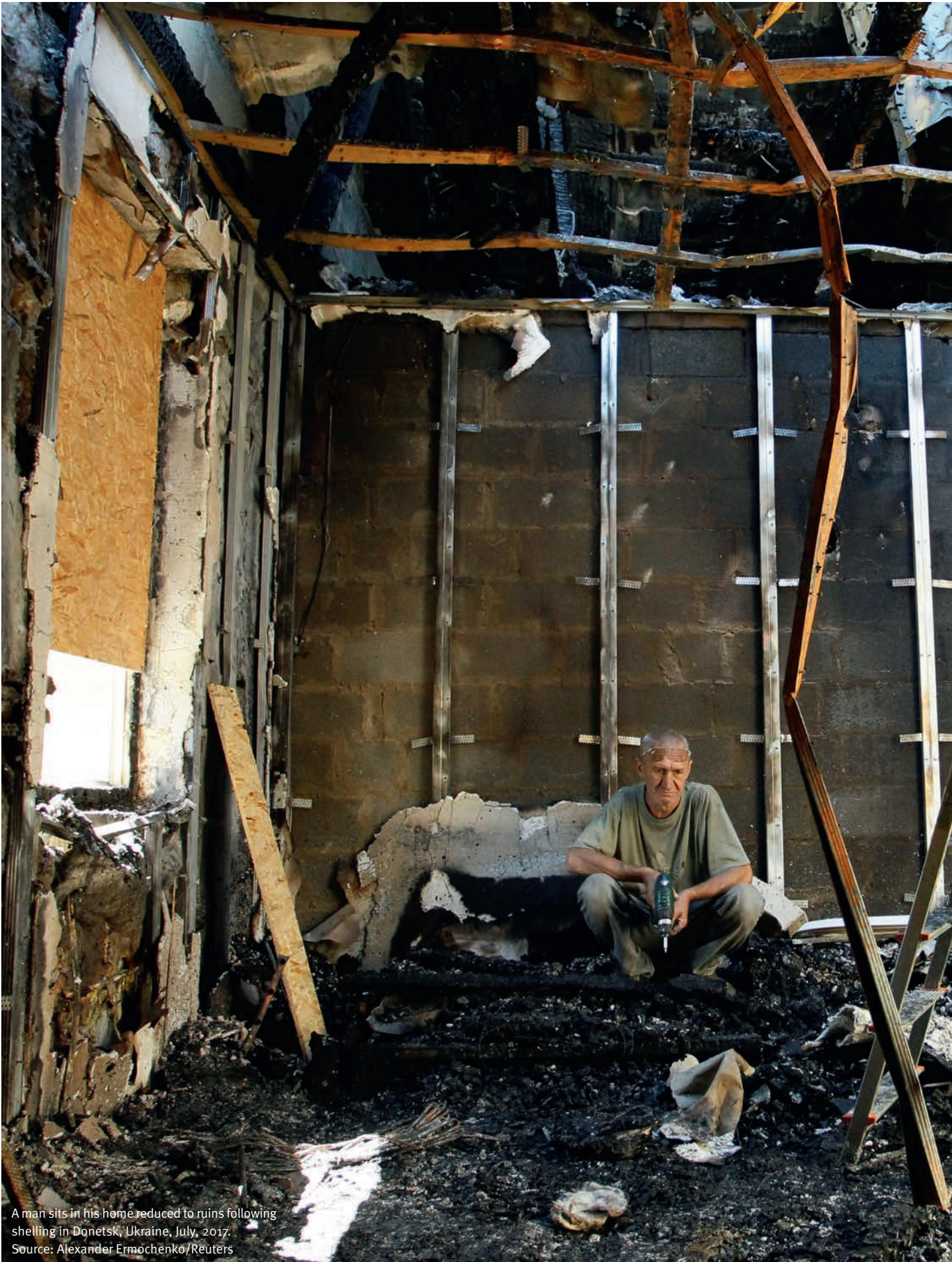
A man sits in his home reduced to ruins following shelling in Donetsk, Ukraine, July, 2017.