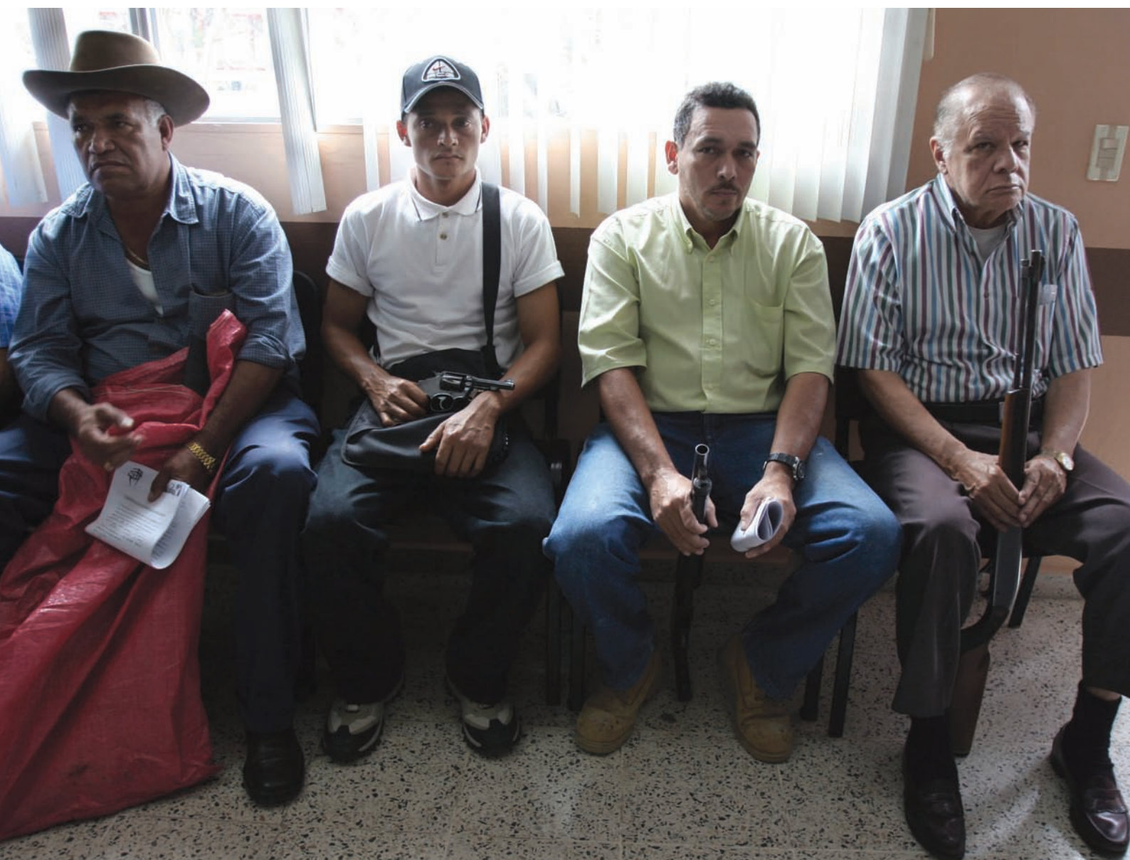
People wait with their firearms to be registered during the last day of arms registration at the Registro Balístico in Tegucigalpa, Honduras, August 2005. Some 140,000 weapons have been registered in Honduras, according to the Criminal Investigation Division (DGIC).

Comprehensive estimates of civilian gun ownership tend to be the most elusive where they are needed most. And there often are no easy rules to rely on. Social science, with its emphasis on verifiable indexes, naturally leads to undercounting total civilian arsenals.