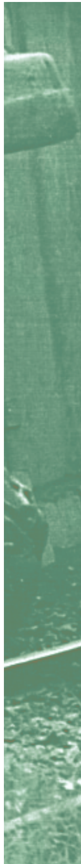
◀ Figure 6: Tank hull destruction by smashing in Poland

Many of these verification organizations have an indefinite existence. Their experience and knowledge is a valuable resource which has applicability beyond the CFE Treaty and should be offered and exploited wherever and whenever possible. They also plan and conduct inspection and observation activities under the CSCE (OSCE) Vienna Document 1994 and assist in other arms control activities, such as inspections under the Dayton Accords. There are few reasons why these verification organizations could not develop the requisite expertise to oversee the collection and destruction of small arms and light weapons within the context of an international regime, or to assist the UN, regional organizations or individual states in that regard. The requirement for assistance (financial or technical) was noted in the summary report emanating from the meeting held under the auspices of the ICRC and the Norwegian Red Cross in May 1998 (Prep Com, 1998). At the very least their organizational structure, knowledge and skill levels and modus operandi provide a model for weapons destruction monitoring and/or implementation regimes, whether small scale in support of UN peace missions or part of an international agreement to destroy surpluses.