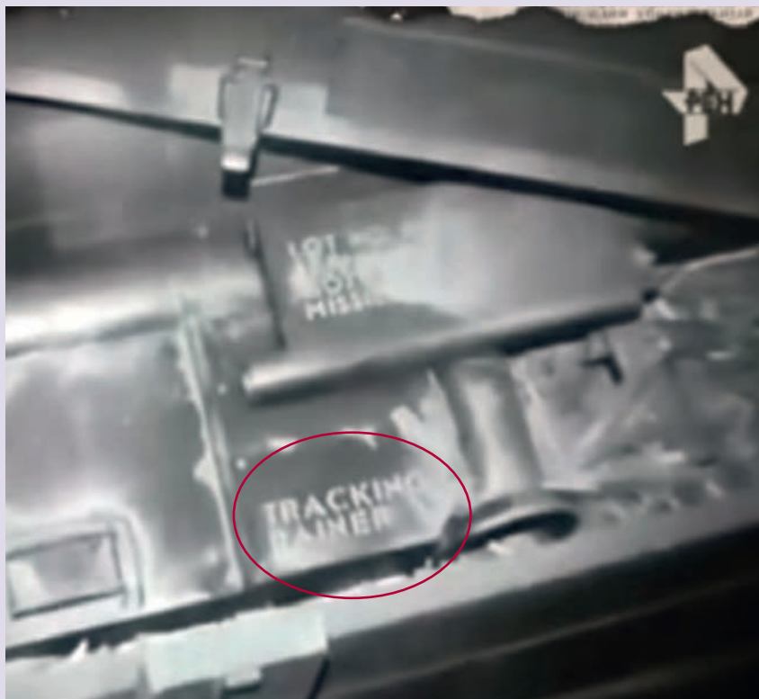
Image 9.6 Fake 'Stinger missile' featured in a video reportedly taken in Ukraine and posted on Youtube, 2015

in Libya before the conflict began' (US AFRICOM, 2011). The official was referring to MANPADS components (individual missiles or launchers) but his statement was widely misinterpreted to mean that the Qaddafi regime had imported 20,000 complete systems. As noted in Chapter 5, a functional MANPADS consists of four main components: a missile, a launch tube, a launcher (gripstock), and a battery unit. Typically, governments import several missiles for every launcher and therefore the number of complete systems in Libya at the time of the uprising was likely only a fraction of the 20,000 MANPADS often cited on social media (Schroeder, 2015a, p. 4). The misidentification of specific models of MANPADS is another source of misinformation. The physical differences between different models of MANPADS are often subtle. This is particularly true for variants of the same model produced in different countries. These variants are often nearly identical in appearance and are sometimes assembled from the same components as the original model. Telling these systems apart requires a trained eye and access to up-to-date reference materials. A final mistake that is often seen on social media is the assumption that all missiles with certain model designations are shoulder-fired. Many missiles with the same model name are fired from both