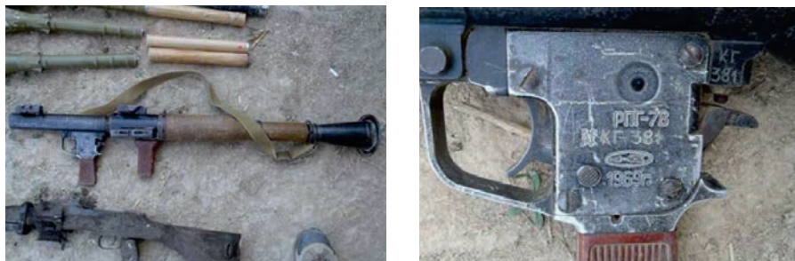
Image 9.1 Weapons seized in an arms cache, Afghanistan, 2011