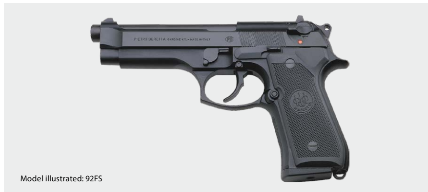
Model illustrated: 92FS

■ TYPE: PISTOL ■ OFTEN REFERRED TO AS: 92, M9 (92FS)