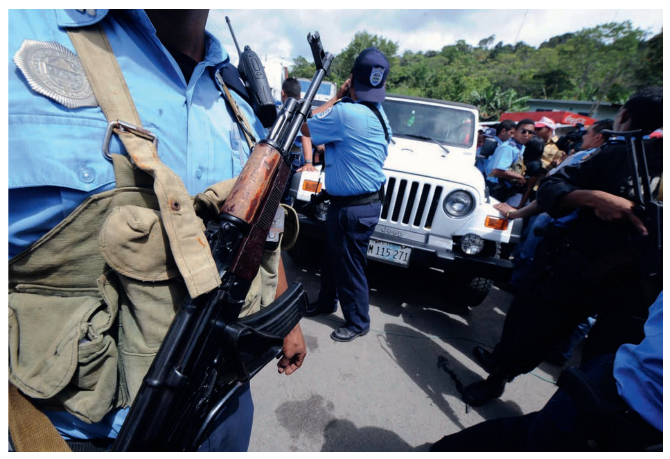
Armed police protect the vehicle carrying Honduran president Manuel Zelaya, Las Manos, Nicaragua, July 2009.

India). In a few countries and territories, only select officers can be armed (for example, England and Wales).