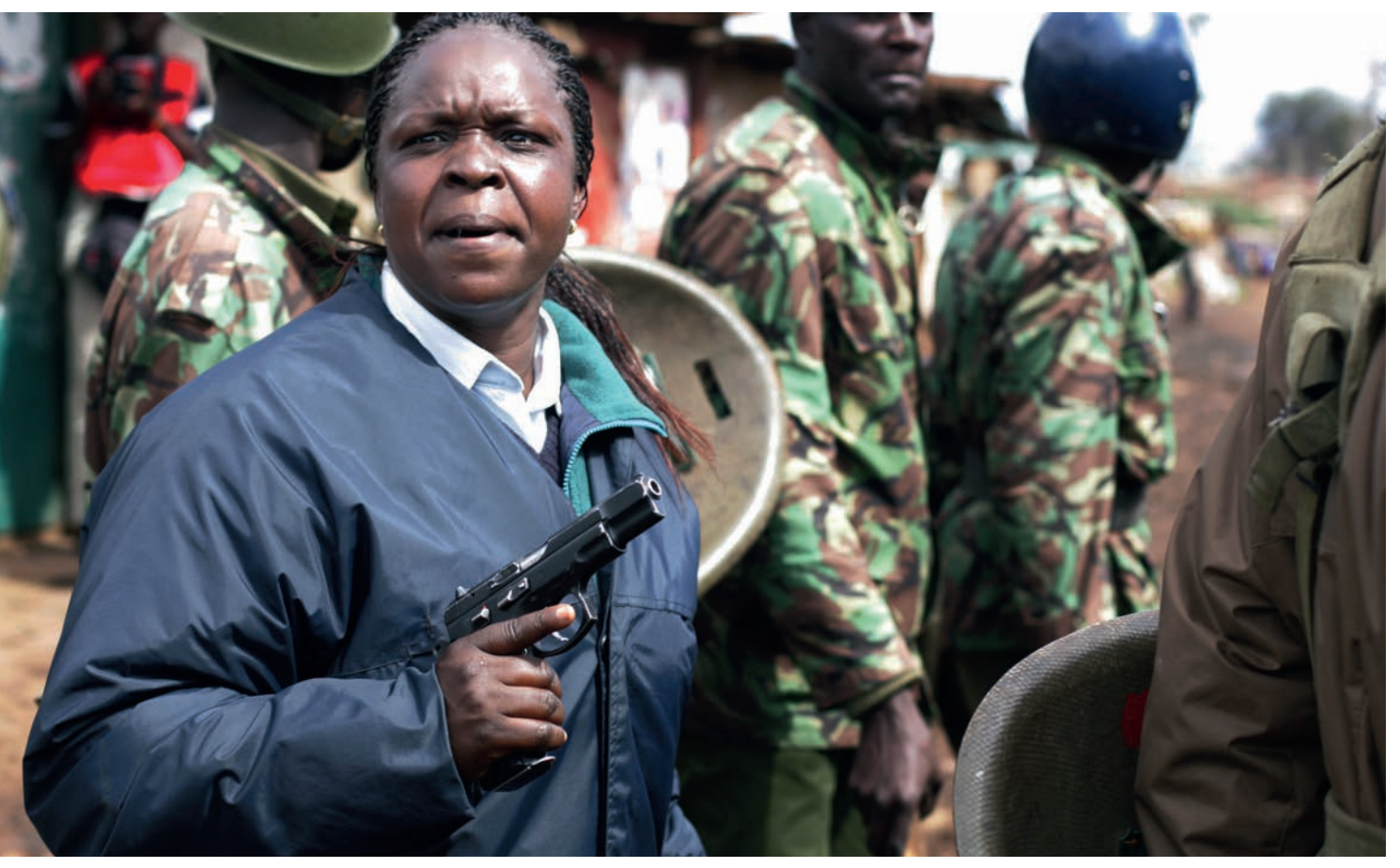
Police officer on duty during protests in Nairobi, Kenya, January 2008.