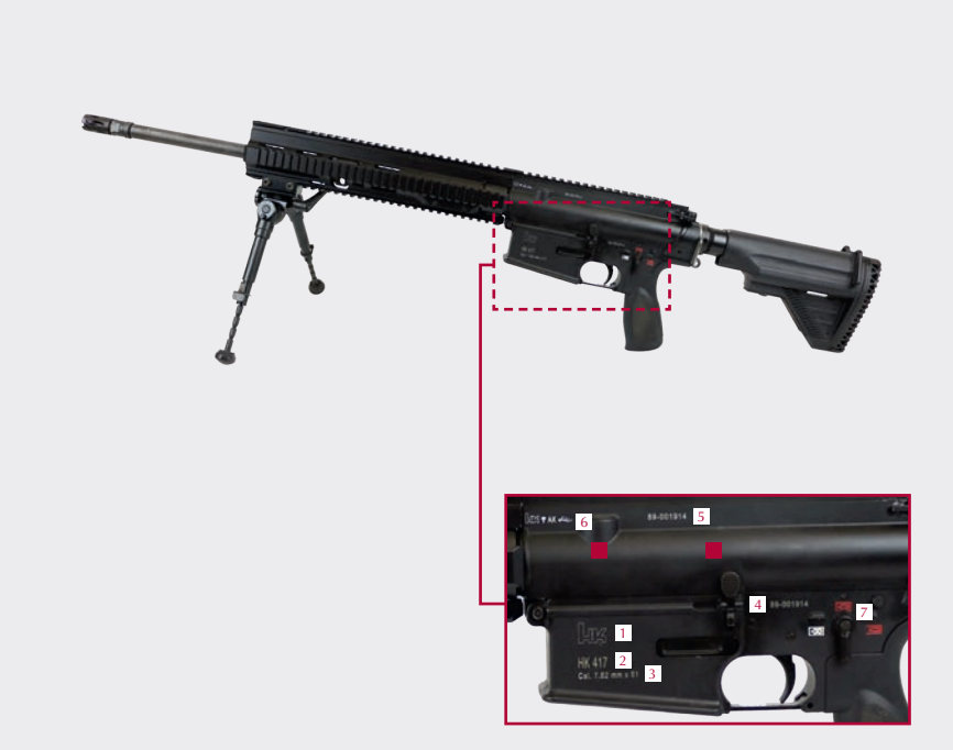
Figure 1.3 Selected markings on a Heckler & Koch HK417 self-loading rifle