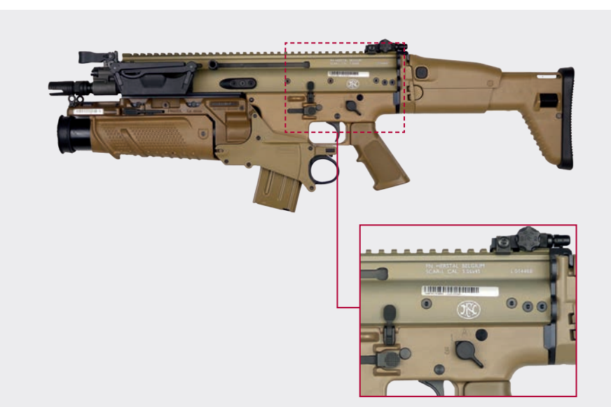
Figure 1.2 Description of a weapon using ARCS