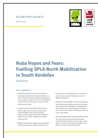
Situation Update Nuba Hopes and Fears: Fuelling SPLA-North Mobilization in South Kordofan