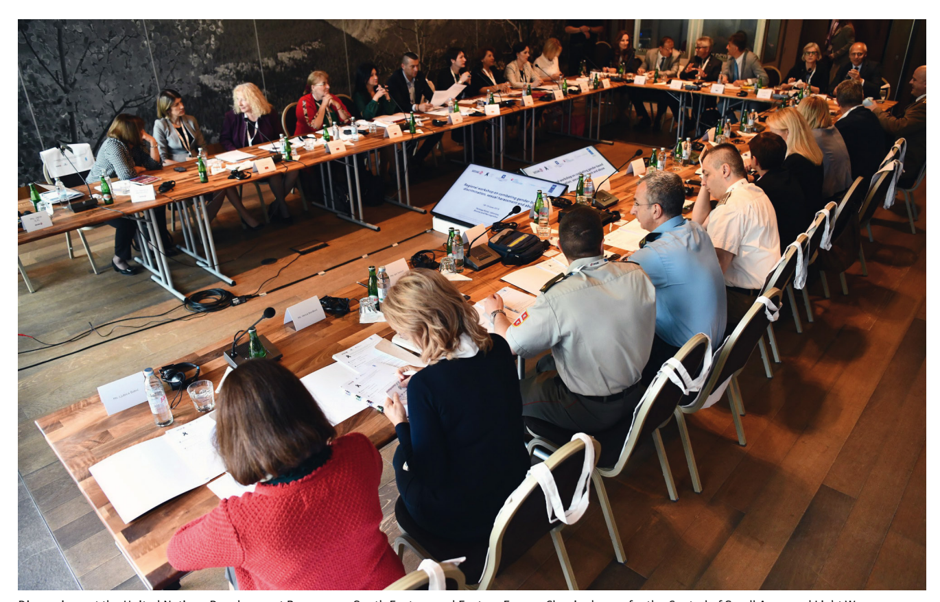
Discussions at the United Nations Development Programme South Eastern and Eastern Europe Clearinghouse for the Control of Small Arms and Light Weapons (UNDP SEESAC) Regional Workshop on Combating Gender-based Discrimination, Sexual Harassment and Abuse, Jahorina, Bosnia and Herzegovina, 19 June 2019.

WPS actors are engaged in monitoring and responding to a large range of different forms of violence. For example, some have developed indicators to track levels of community and gender-based violence, because these may be early warning signs of conflict (Acheson and Butler, 2018, pp. 692-94). Collaborative research between national WPS and small arms control actors that links the illicit supply of small arms to increases in violence would be an effective way to produce policy-relevant inputs as part of both WPS and small arms control NAPs. This would also facilitate more effective monitoring frameworks (UN, 2018, p. 16). Moreover, small arms control actors could consider incorporating violence reduction efforts previously used by WPS actors into their NAPs, such as those engaging men to promote non-violent expressions of masculinity (Cukier and Cairns, 2009, p. 41; Schöb and Myrttinen, 2022, pp. 17-18; Schroeder, Farr, and Schnabel, 2005, p. 26). Similarly, small arms control actors may identify actions