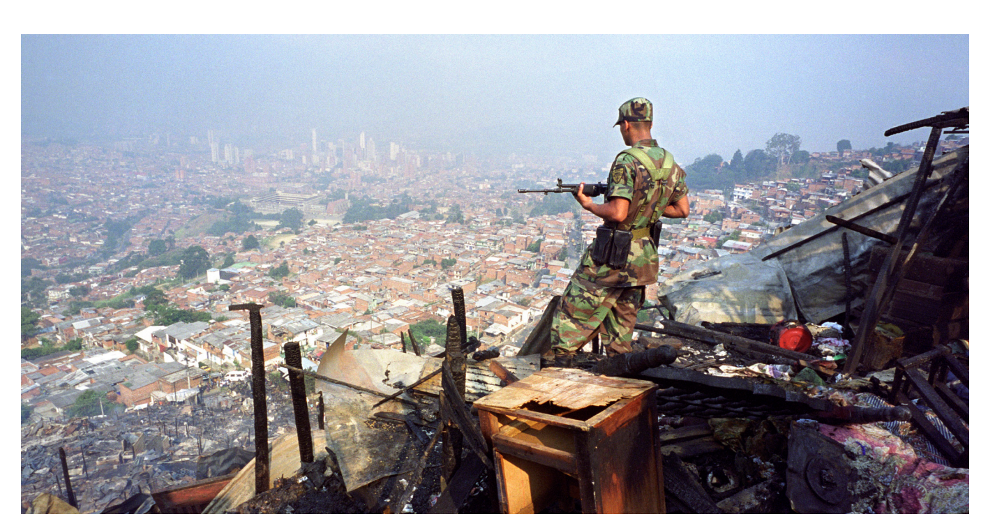
\textbf{Colombia}, \textbf{Medillin}, \textbf{Antioquia}. \textbf{ A soldier stands amongst the burnt remains of the settlement of displaced families.} \\