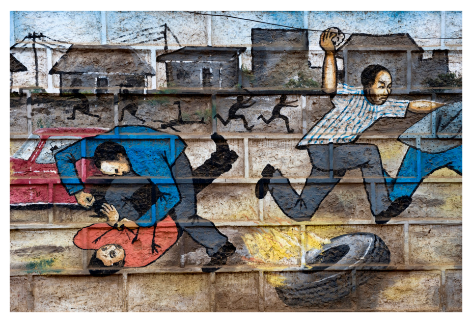
Kenya, Nairobi. A mural in the Kibera slum depicting urban violence.

Community policing is a central aspect of arms control and the prevention and reduction of violence linked to gangs and organized crime. Police reform has led to a more community-oriented policing strategy based on the acknowledgement that 'security is a task for all' (Dammert, 2009, p. 122). This shift represents a departure from controloriented policing towards the inclusion of prevention mechanisms in local security plans (Dammert, 2009, p. 139). On the one hand, this approach to policing promotes a rapprochement between the police and communities; on the other hand, it encourages associative relations with the broader community—including its business associations, local clubs, and unions