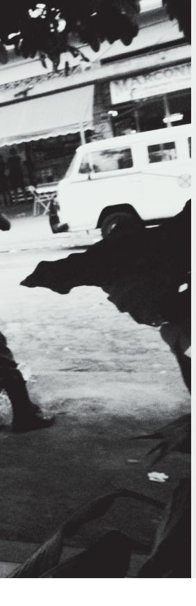
In the Rio favela of Vila Cruzeiro, police pursue members of the gang Comando Vermelho (Red Command), May 2007.

In the late 1990s, UNDP and the National Council for Public Security (NCPS) mapped out the scale and burden of armed violence. The NCPS embedded its subsequent armed violence reduction interventions in existing international and regional standards such as the 1999 Inter-American Convention on Transparency in Conventional Weapons and the 1997 OAS Model Regulations for the control of firearms.<sup>30</sup> A coalition— 'Society without Violence' (SWV)—was created to advance the issue, and this proved decisive.