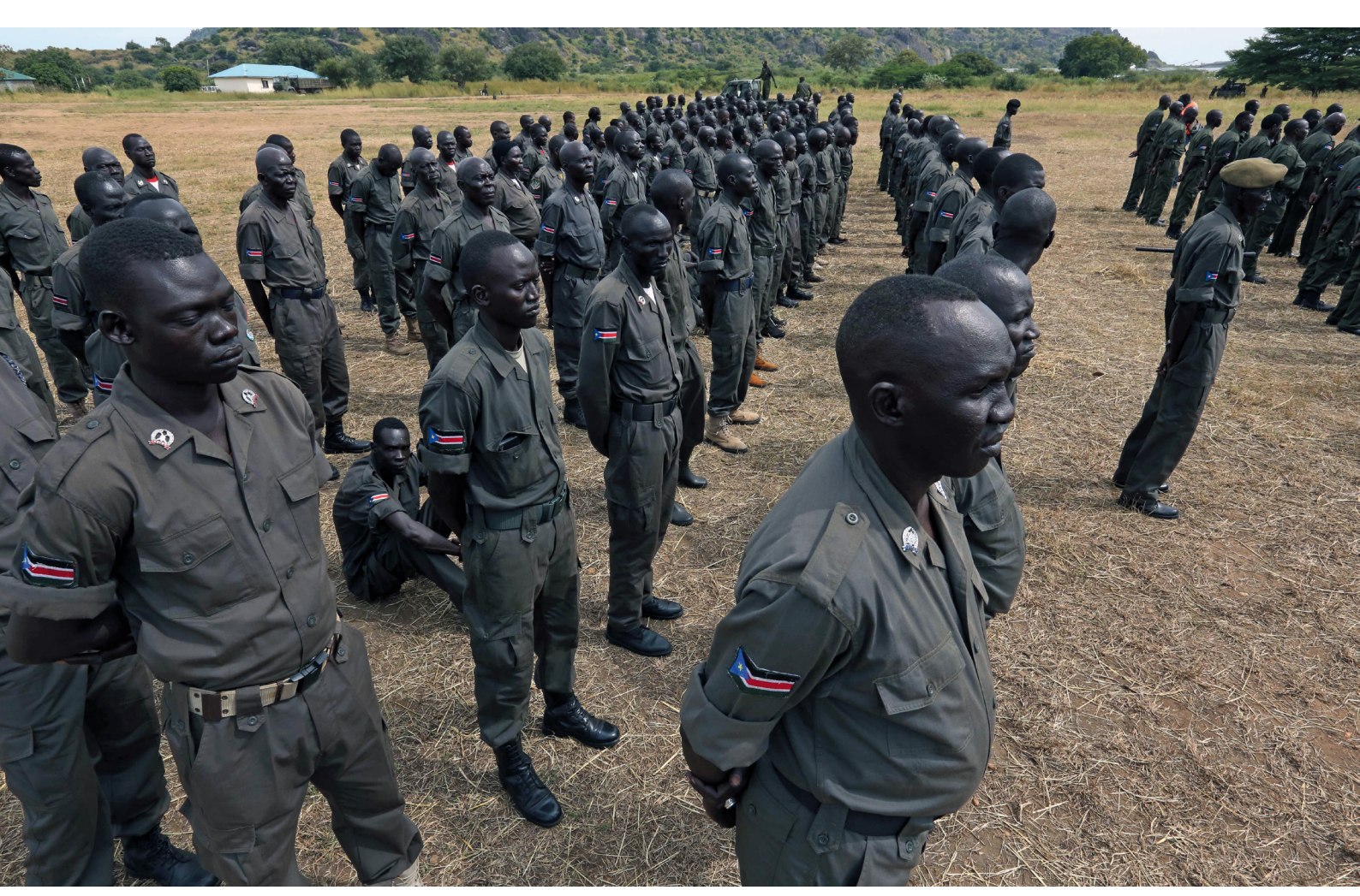
A training-of-trainers programme for South Sudan's new unified army takes place at the Military Training Centre in Luri near Juba, October 2019.

There are clear indications that the warring parties have taken advantage of the immense scope for force inflation across the country, in violation of the terms of the R-ARCSS, which stipulates that no new recruitment or force inflation should take place. The CTSAMVM found evidence of two illegal SSPDF training centres in Bor and Yei recruiting and training police in July 2019. Meanwhile, in Kiir's home area of Warrap, plausible rumours of an SSPDF recruitment drive spearheaded by the president circulated in late 2018 and early 2019.9 Written directives from a senior member of the SSPDF were allegedly issued to SSPDF ground