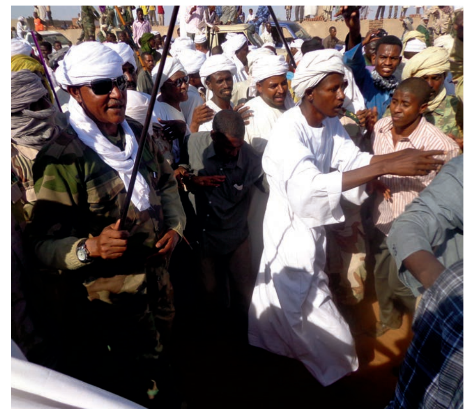
Musa Hilal (L.) salutes his followers upon arriving in Nyala, South Darfur on 7 December 2013.

This Issue Brief examines the history of Sudan's militia strategy and the role of militias in the country's armed