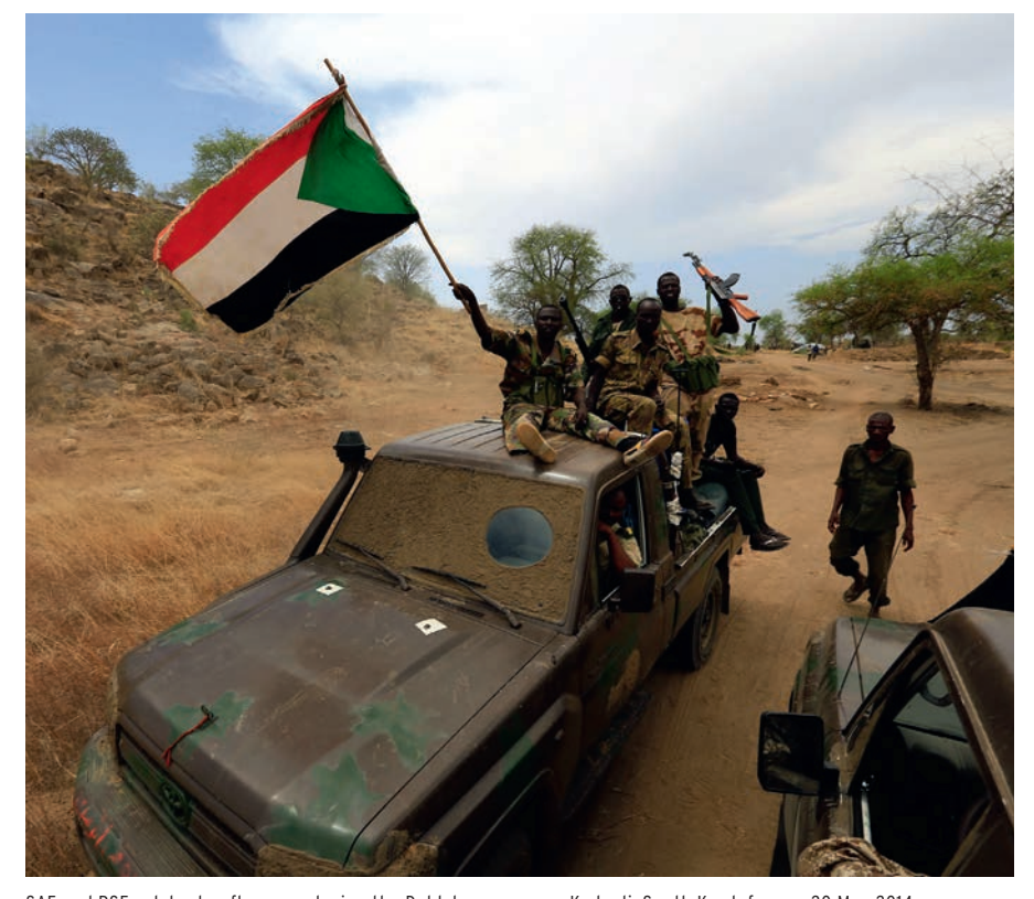
SAF and RSF celebrate after recapturing the Daldako area, near Kadugli, South Kordofan, on 20 May 2014.

In April 2016 a presidential decree reportedly placed the RSF directly under the presidency's control.<sup>28</sup> In January 2017, with SAF support but against Hemmeti's wishes, the Sudanese Parliament tried to pass an 'RSF Act' putting the RSF under SAF control. The proposed law was reportedly worded so that the RSF was ambiguously labelled an 'autonomous' force