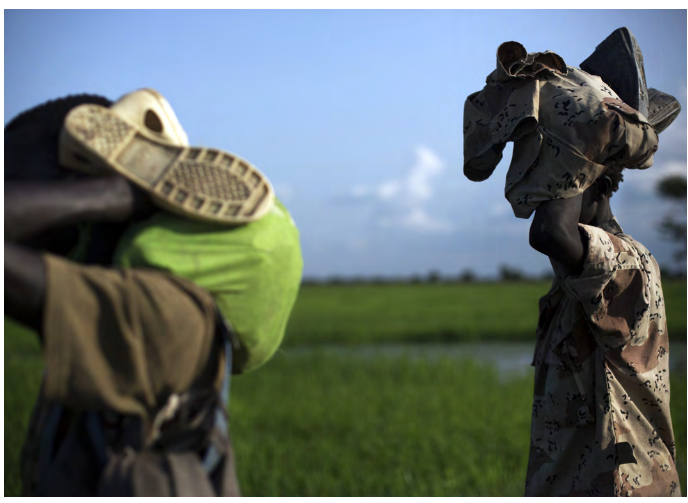
Yuai village, Uror county, Jonglei, Lou Nuer youth returning after fighting against David Yau Yau's militia, 23 July 2013.

able to significantly reduce the militia operations in South Sudanese border areas. The closing off of the border to the insurgents also meant that their access to their support bases within South Sudan was cut off, and they were primarily utilized by the GoS in its operations against the SPLM-N, which further alienated them from their political agendas in the South. The faltering Sudan-South Sudan agreement and economic hardship resulting from the temporary closing of the oil pipeline have also contributed to Sudan's willingness to engage in peace negotiations with the GRSS.