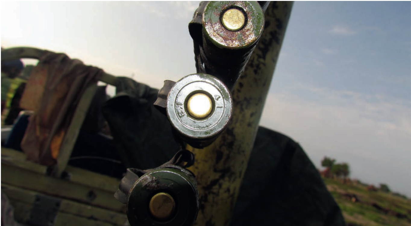
Photos 2 and 3: JEM Land Cruiser vehicle mounted with Sudanese-made DShK machine gun and Chinese-manufactured 12.7 x 108 mm ammunition. Captured in Bau, South Sudan, May 2014.