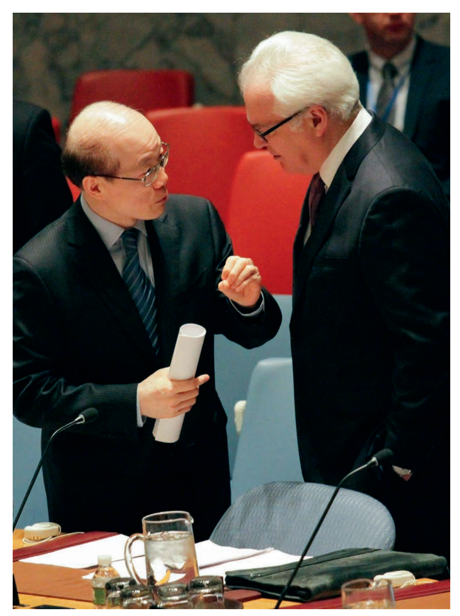
Photo 4: China's ambassador to the United Nations, Liu Jieyi, left, confers with his counterpart from the Russian Federation, Vitaly Churkin, in March 2016 at the UN in New York.

2016 across all the UN sanctions committees.<sup>117</sup> In addition, they reported that China was returning to its previously vocal stance in the Sudan Sanctions Committee.<sup>118</sup>