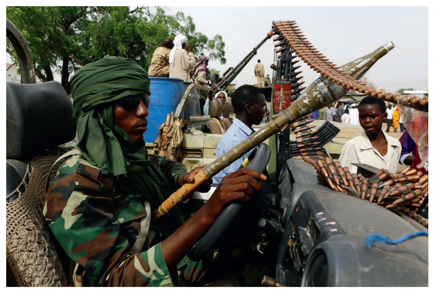
Photo 1: An RSF fighter participates in the display of weapons and vehicles allegedly captured from JEM. Nyala, South Darfur, May 2015.

Dry-season fighting in 2014, 2015, and early 2016 has returned Darfur's levels of violence and population displacement to 2007-08 levels. The Sudanese government waged three concerted offensives against SLA-MM and SLA-AW, led by a new militia structure, the Rapid Support Forces (RSF). Recruited by Sudan's National Intelligence and Security Service (NISS) from mid-2013, RSF fighters were primarily drawn from Darfur Arab tribes; they fought in South Kordofan before returning to Darfur in February 2014. The weakly controlled RSF is under the formal command of an NISS major general, but in practice these combatants are primarily led by Abbala Rizeigat war leader Mohammed Hamdan Dagolo 'Hemeti', who previously led a 'janjaweed' militia and briefly turned against his government sponsors around 2007.