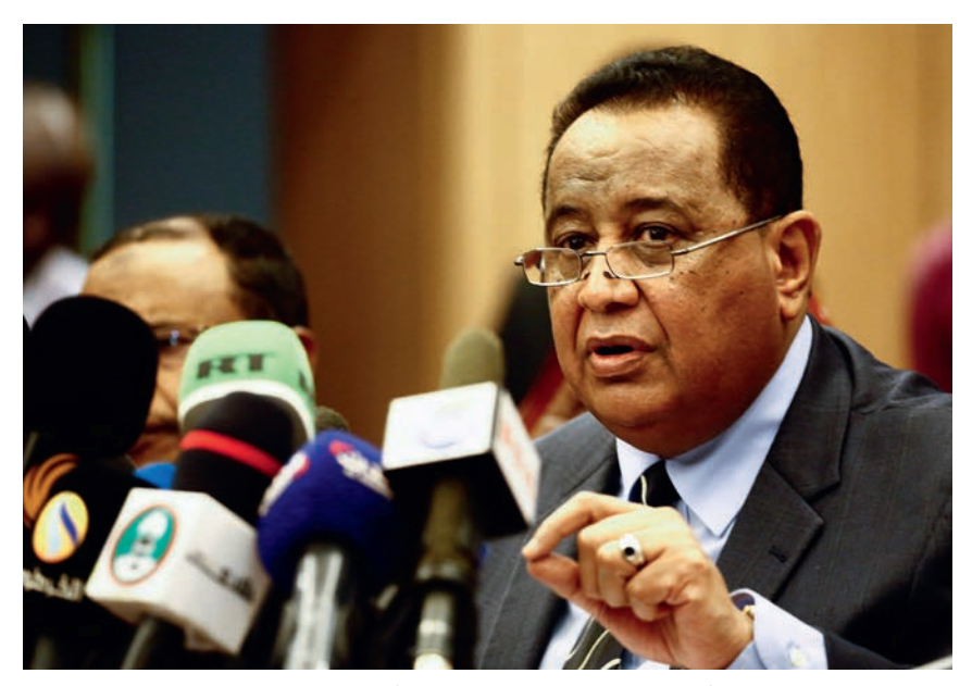
Former foreign minister Ibrahim Ghandour (pictured here in Khartoum, July 2017) led Sudanese negotiations to lift US economic sanctions on Sudan. He was sacked by President Omar al-Bashir on 19 April 2018.

approach to the sanctions criteria was possible because of the latitude built into a unilateral, executive-driven sanctions regime, and allowed political trade-offs that US officials have argued are necessary if sanctions are to be used as leverage in the most achievable or urgent policy areas.<sup>17</sup>