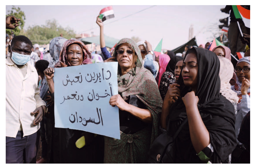
Female protesters hold a sign with the slogan 'Let's live as brothers and sisters and let's build Sudan together' during the sit-in at Sudan's military headquarters, Khartoum, 14 April 2019.

States. These efforts produced the Comprehensive Peace Agreement (CPA) in 2005, national elections in 2010, and the secession of southern Sudan in 2011 to form the new state of South Sudan. Sudan's relations with the United States had been tense, but improved when the regime accepted the US-led peace process, with the expectation that this would end the sanctions and the country's isolation. The southern peace process provided the al-Bashir regime with a new lease on life, because the peacemakers needed the regime to implement the CPA, but the process also provided valuable political space for Sudan's long-repressed civil society. The regime experienced a major blow in March 2009, however, when the International Criminal Court (ICC) indicted al-Bashir for the conduct of his government's war in Darfur, which increasingly isolated him internationally.