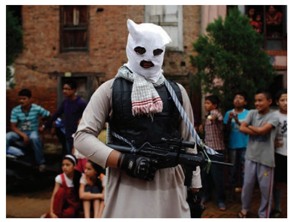
A masked devotee holds a toy gun as he takes part in a parade during a religious festival, indicating the salience of armed groups in Nepali society, in Lalitpur, August 2012.

This Issue Brief analyses the phenomenon of armed groups in Nepal. It examines their history, their initial proliferation following the signing of the