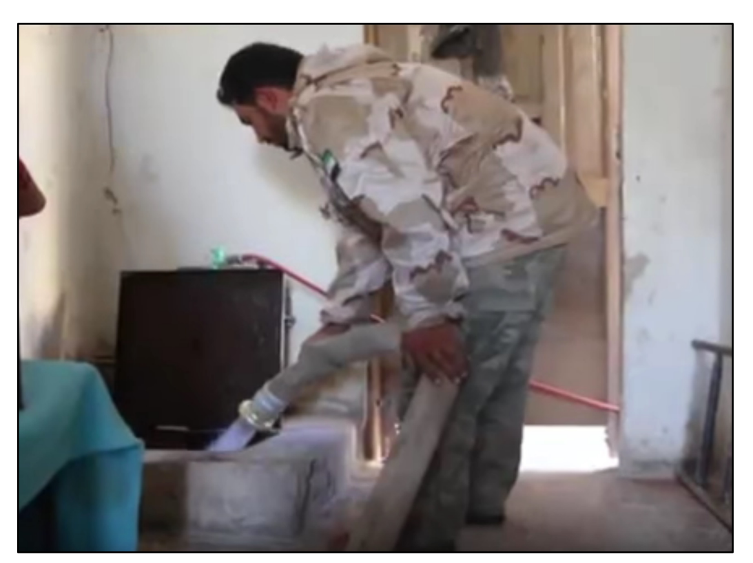
Photo 2: Firqa 13 provides drinking water to the civilian population of Maarat al-Numaan, Syria, November 2015.

In areas where the FSA maintains a presence, a system of governance has developed in the form of so-called 'local councils' that manage the aforementioned courts. In addition, local councils manage projects that pertain to the reconstruction and running of public facilities, such as the delivery of water, electricity, medical care, education, and policing (NCS, n.d.; Glasman, 2014).<sup>49</sup> Funding for these projects