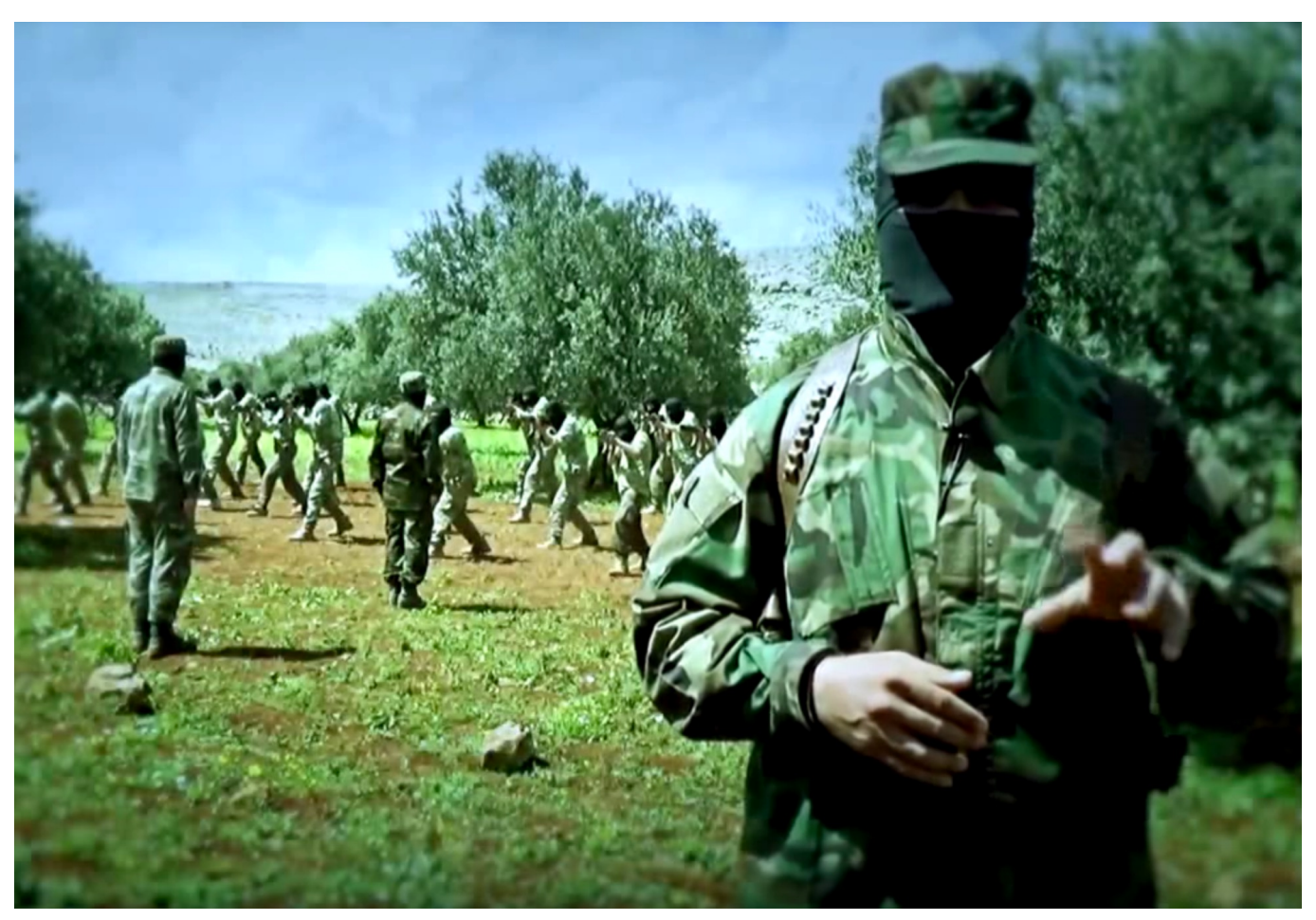
Photo 1: Video image of Jaysh al-Mujahideen's 'session 14' recruits taking part in a 'training exercise' at an undisclosed location in Syria.

In the formation of strategic alliances, moderate armed groups face restrictions due to their reliance on Western donors. As they cannot formally participate in coalitions that include controversial groups such as JAN, moderate armed groups have limited opportunities to increase their military effectiveness through coordination with other armed groups.<sup>32</sup> Yet, with every military success of coalitions in which the FSA does not have a visible role, such as the takeover of Idlib city, the image of moderate factions as a weakening force is reinforced, making them less attractive to potential recruits.