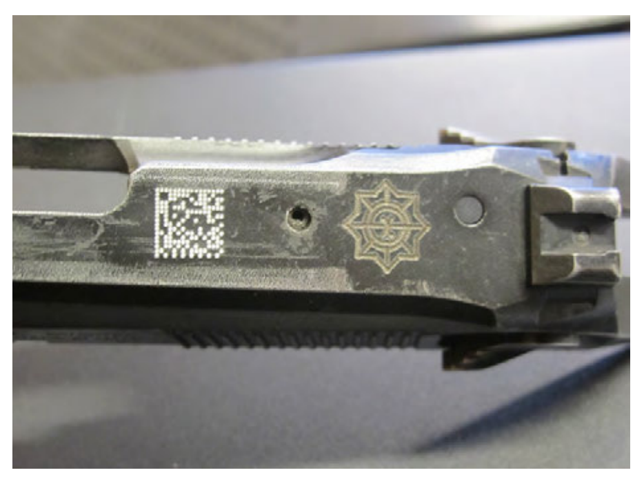
A two-dimensional data matrix code.