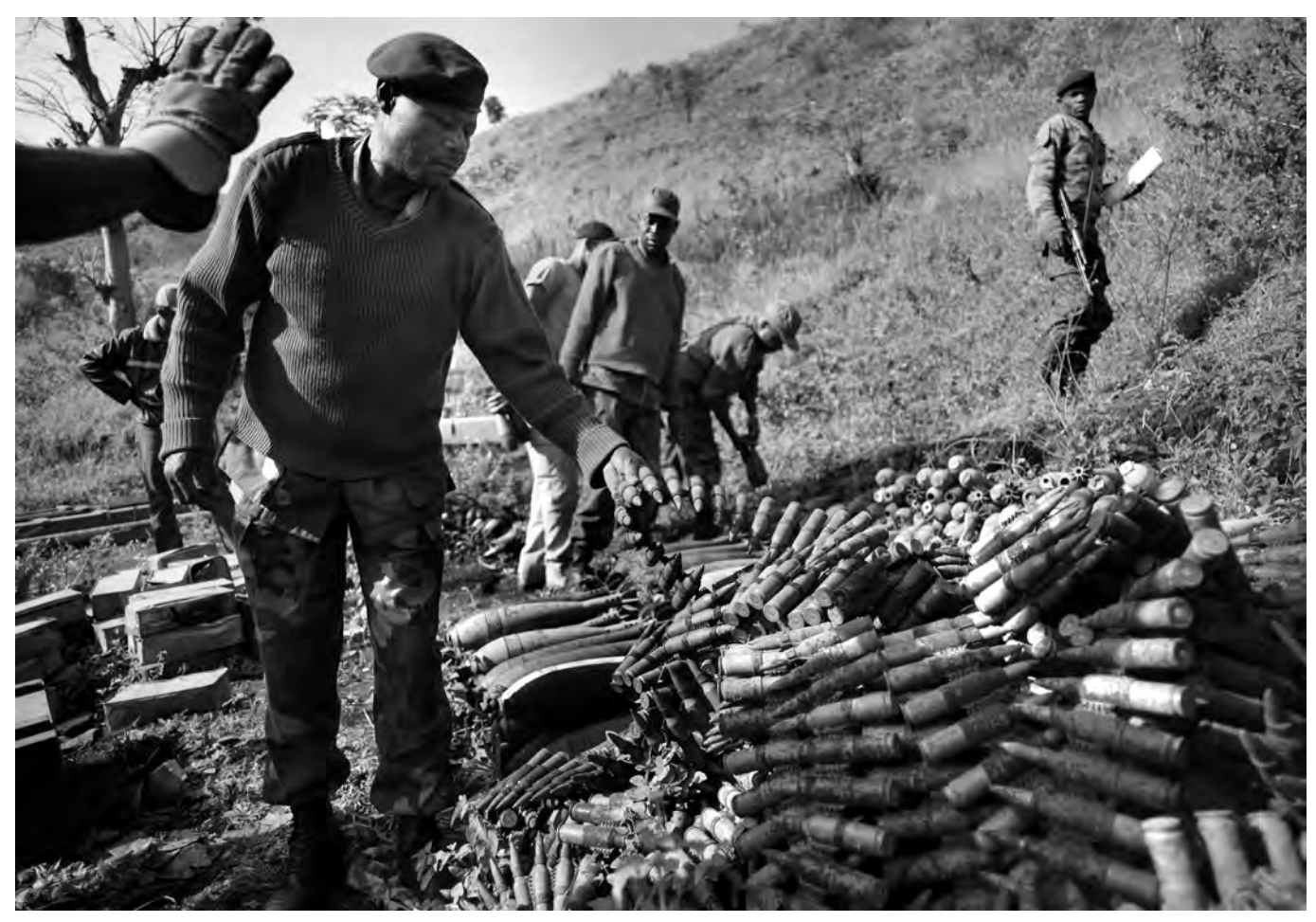
With assistance from soldiers, a MAG (Mines Advisory Group) team take munitions from an open-air stockpile for destruction, near Goma, DRC, September 2012.

One can certainly question the amount of diplomatic effort that went into a meeting outcome that, at some level, is self-evident. Yet that outcome, although unexciting, is in fact useful on several levels. First, compared to the outcomes of previous PoA meetings, the BMS5 text clearly builds on preceding discussions concerning subjects such as women's participation