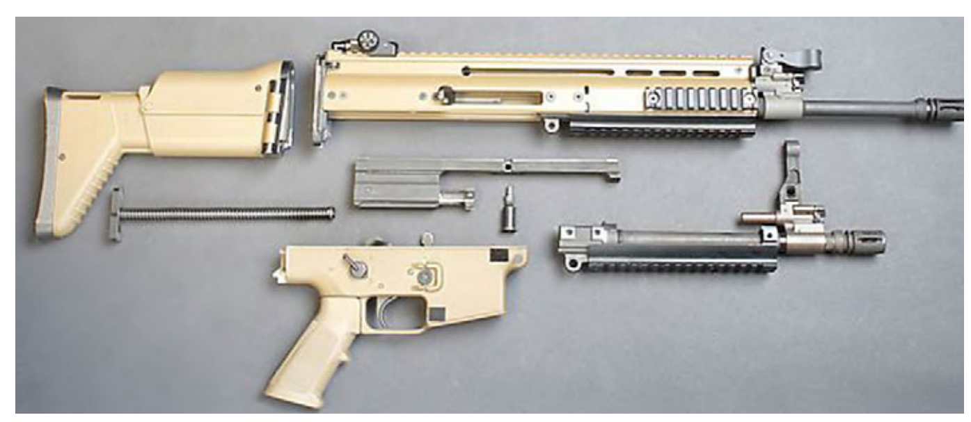
A partially-disassembled SCAR-L (Special Forces Combat Assault Rifle).

A related problem is that, in addition to certain required identifying marks—manufacturer, country of manufacture, and serial number—the