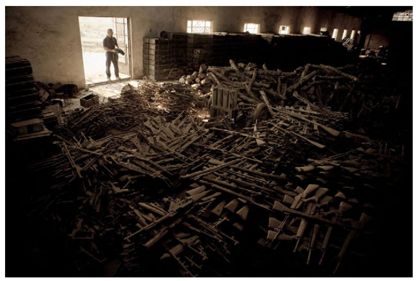
Weapons and ammunition stored in a disused factory in Lubumbashi, Katanga province, DRC, 2009.

Although it is a separate instrument, the ITI, devoted to weapons marking, record-keeping, and tracing, was developed within the framework of the PoA. BMS5 was the third time the UN membership took up the ITI in the context of a BMS. While the first such meeting, BMS3, had seen UN member states engage with the new instrument in a relatively 'practical and focused' way,34 BMS4 saw them in a holding pattern, with the meeting outcome on the ITI offering little value added over its predecessor.35 In fact, the BMS5 outcome on the ITI takes its cue not from the BMS3 and BMS4 texts, but from the outcome document of the PoA's Second Review Confer-