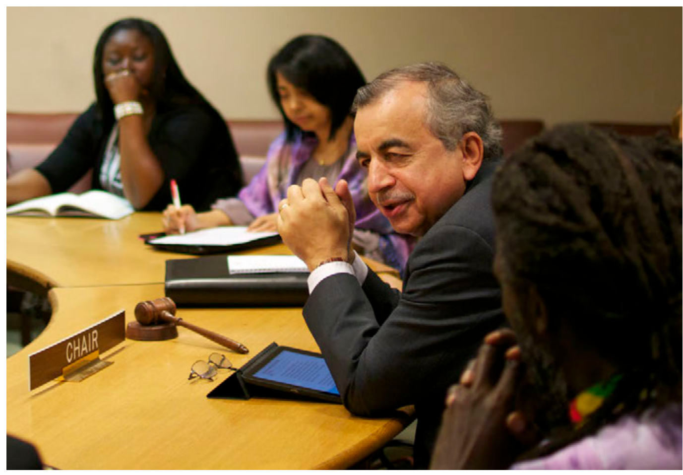
Members of IANSA meet with the chair of BMS5, Ambassador Zahir Tanin, UN headquarters, New York, 17 June 2014.

■ Following months of intense diplomatic activity, the BMS5 process produced an outcome document featuring practical implementation