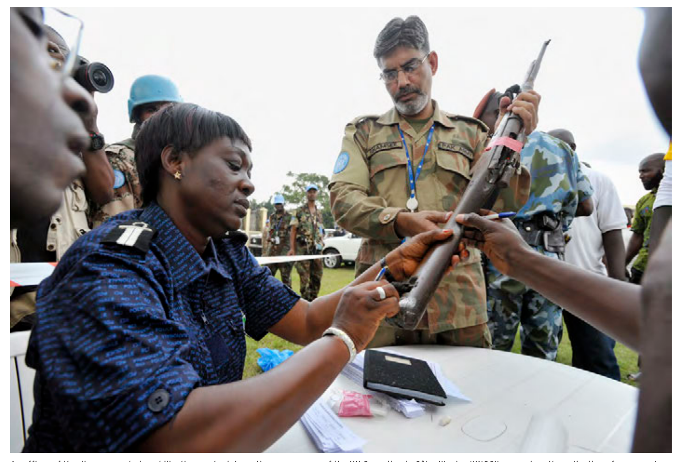
An officer of the disarmament, demobilization, and reintegration programme of the UN Operation in Côte d'Ivoire (UNOCI) supervises the collection of weapons by UN peacekeepers and the Republican Forces of Côte d'Ivoire (FRCI), Abidjan, February 2012.

This more positive assessment assumes that the measures contained in the BMS5 outcome will be translated into concrete laws, policies, and programmes in the communities, countries, and regions affected by small arms violence. The Issue Brief returns to this question later, in its conclusion, but first focuses on another form of follow-up, namely that which can be conducted in UN meeting halls. As noted above, BMS5 did not consider in any depth the implications of new technologies for ITI implementation, leaving this to the governmental experts who will convene at UN headquarters for MGE2 in June 2015 (UNGA, 2014g, para. 40; 2014h, para. 6). The next section of the Issue Brief. finalized in January 2015, looks ahead to MGE2, examining the subjects with which participants will have to contend at that meeting.