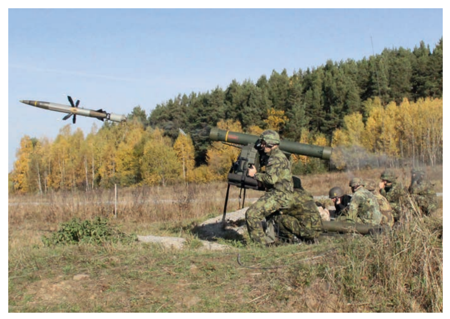
A Swedish Saab RBS 70 NG CREWPADS firing a BOLIDE 'all-target' SAM.