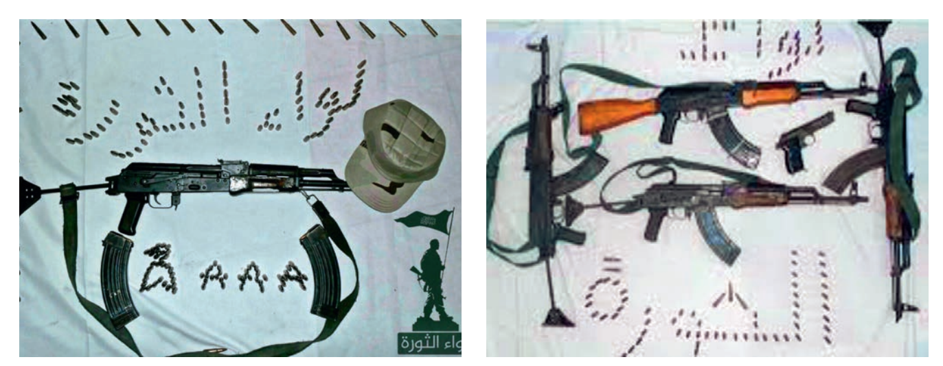
Propaganda photos posted on social media by Liwaa al-Thawra, featuring weapons and ammunition.

After a relatively quiet summer, more pro-violence Islamist groups emerged between autumn 2014 and spring 2015.<sup>14</sup> These groups urged 'popular resistance' and openly embraced the use of firearms. This call to violent action was echoed by MB-affiliated or -sympathetic media