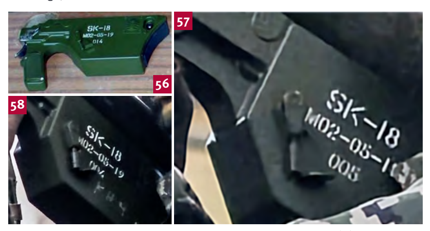
Images 56–58 QW-18-pattern MANPADS gripstocks with nearly identical markings, 2013 and 2018

Notes: An SK-18 gripstock found in an Iranian arms shipment to the Houthis in 2013 (56); SK-18 gripstocks displayed by the Ezzedeen al-Qassam Brigades in the Gaza Strip in 2018 (57, 58). The gripstocks spotted in the Gaza Strip have the same manufacture date and lot number as the Iranian-supplied MANPADS seized five years earlier.