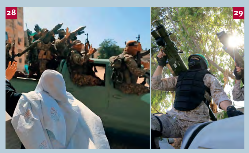
Images 28-29 North Korean MANPADS displayed by members of the Ezzedeen al-Qassam Brigades, 2021

Notes: Ezzedeen al-Qassam Brigades members displaying North Korean MANPADS in northern Gaza, May 2021 (28) and in Gaza City, June 2021 (29).