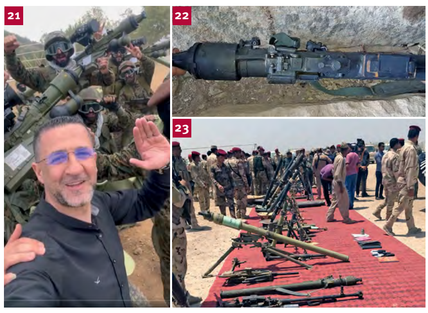
Images 21–23 Igla-1-pattern MANPADS in the possession of armed groups in the MENA region, 2016–23

Notes: Multiple Igla-1-pattern MANPADS displayed by members of Lebanese Hezbollah during military drills in 2023 (21); Igla-1-pattern launch tube seized from the PKK in Türkiye in 2017 (22); Igla-1-pattern launch tube seized from IS by Iraqi authorities in 2016 (23).