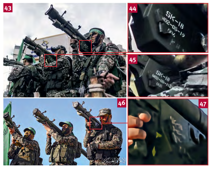
Images 43-47 QW-18-pattern gripstocks displayed by members of the Ezzedeen al-Qassam Brigades, 2018

Notes: Members of the Ezzedeen al-Qassam Brigades displaying QW-18 gripstocks during a military parade commemorating Hamas' 31st anniversary. 'SK18' is the model designator for a QW-18 gripstock. All of the gripstocks are attached to Strela-2-pattern launch tubes, a previously unseen pairing.