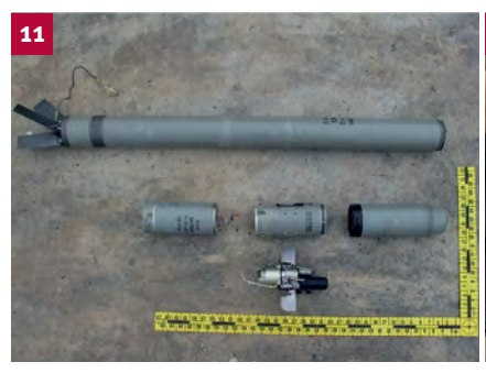
Images 11–12 48-year-old Strela-2-pattern MANPADS components examined by EOD technicians