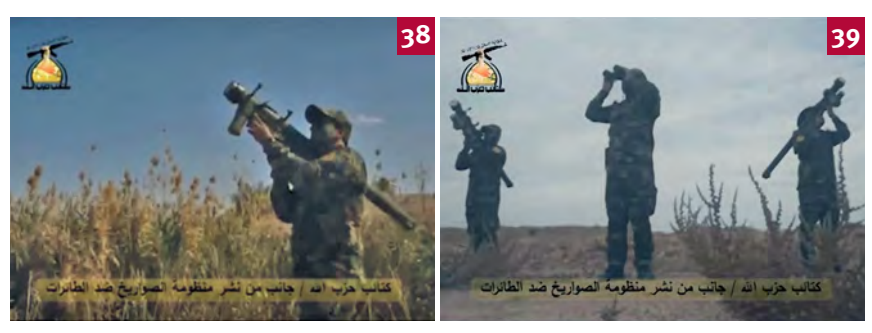
Images 38-39 QW-pattern MANPADS displayed by Kata'ib Hezbollah in Iraq, 2015

Notes: Screenshots from a video showing a member of Kata'ib Hezbollah with a QW-1-pattern MANPADS (38) and two QW-18-pattern MANPADS (39). The video features Kata'ib Hezbollah's logo (top left of frame), and the individuals holding the MANPADS are wearing patches associated with the group.