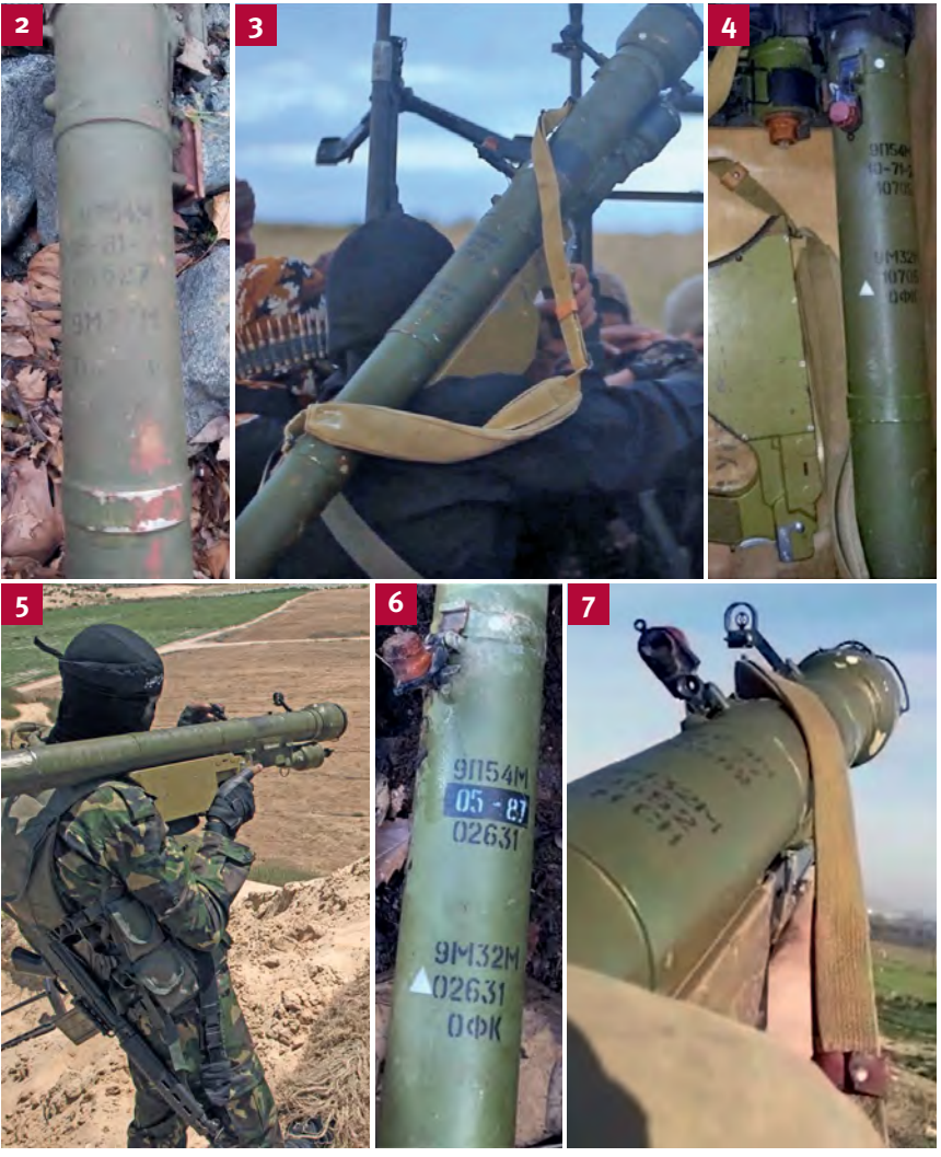
Images 2–7 Imagery of the markings on the launch tubes of illicit Strela-2M-pattern MANPADS in the MENA region, 2015–20

Notes: Strela-2M launch tube found by Turkish authorities, 2020, manufactured in 1981 (2); launch tube reportedly displayed by a member of Islamic State-Sinai Province (IS-SP) in Egypt, circa 2019, manufactured in 1977 (3); MANPADS in a crate filmed in Syria, circa 2018, manufactured in 1971 (4); MANPADS displayed by the Nasser Salahedeen Brigades in Gaza, 2015, manufactured in 1977 (5); launch tube seized by Turkish authorities, 2019, manufactured in 1987 (6); screenshot from video footage of a launch tube reportedly taken in the Gaza Strip, circa 2020, manufactured in 1977 (7).