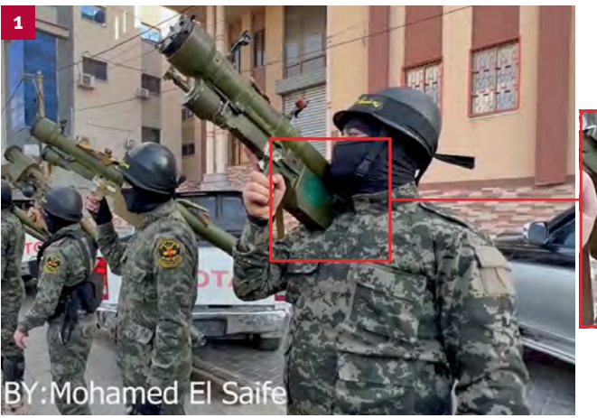
Image 1 Chinese gripstock displayed by al-Quds Brigades in the Gaza Strip, 2023

Imagery of other Strela-pattern MANPADS and components raise similar questions about the functionality of some of the other illicit Strelas identified by the Survey. Several of the images of illicit Strela-2Ms reveal that they were damaged, caked with dirt, or found with other munitions that were rusted or showed other obvious signs of deterioration due to improper storage. This is especially true of MANPADS found in legacy arms caches in Iraq, Libya, and Yemen (see Images 8-10). It would, however, be a mistake to assume that all illicit Strela-2-pattern MANPADS in the MENA region are non-functional. US government documents obtained under the Freedom of Information Act indicate that the shelf life of first- and second-generation MANPADS can exceed