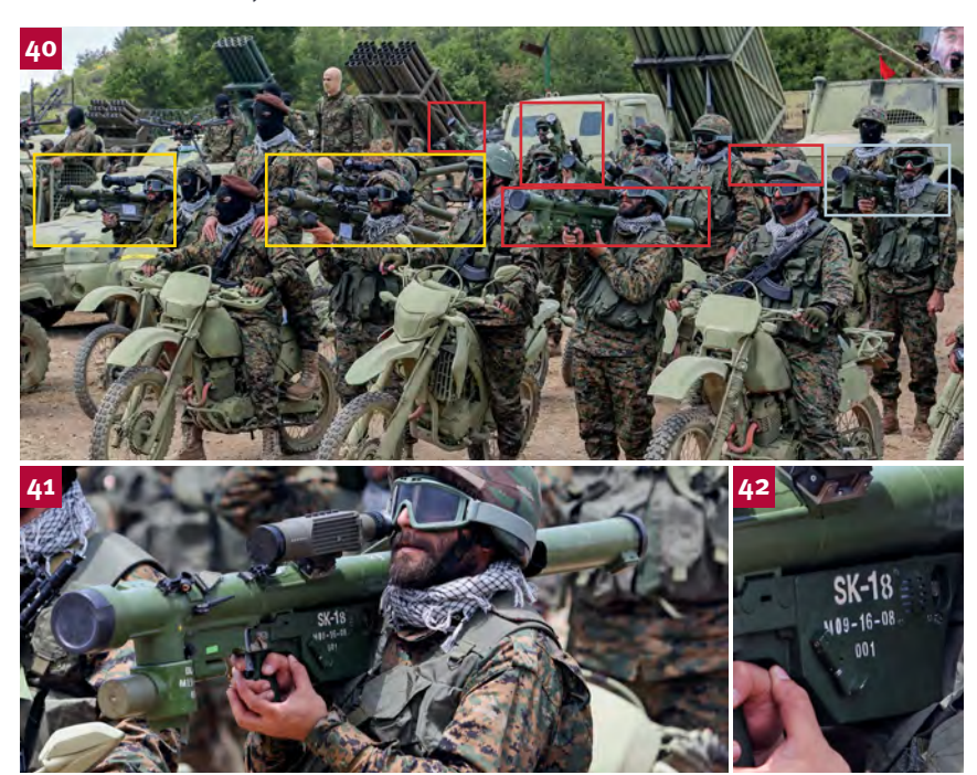
Notes: Hezbollah members displaying at least ten MANPADS, including five QW-18-pattern systems (red boxes), four Igla-1-pattern systems (yellow boxes), and one QW-1-pattern system (blue box) (40); markings on one of the QW-18-pattern MANPADS gripstocks indicating that the item was manufactured in 2016 (41). The oddly shaped '8' in 'SK-18', however, raises the possibility that some or all of the gripstocks have been re-marked (42).

In the Palestinian Territories, Ezzedeen al-Qassam Brigades' advanced MANPADS consist primarily of Soviet-designed Igla-pattern MANPADS but also include at least a small number of QW-series gripstocks, which were first spotted at a military parade organized by the group in 2018. The Survey identified at least three QW-18 (SK-18) gripstocks attached to Soviet Strela-2-pattern launch tubes—an unusual combination not previously identified in publicly available sources (see Images 43–47). Whether the gripstocks are compatible with Strela-pattern missiles is unclear, along with the reason for the unusual pairing. One possibility is that the group's MANPADS holdings are limited, as is their ability to acquire additional components for their Soviet-designed systems. Nevertheless, it is another interesting example of the gradual encroachment of Chinese-designed systems in the traditionally Soviet/Russian-dominated market for illicit MANPADS.