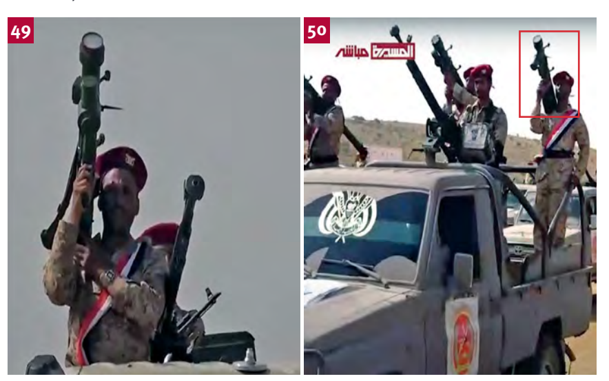
Images 49–50 QW-18- and QW-1-pattern MANPADS displayed by Houthi soldiers, 2022

Notes: Houthi soldiers displaying QW-18-pattern MANPADS (49) and QW-1-pattern MANPADS (50) during a military graduation ceremony in the Sixth Military District, Amran, Yemen, August 2022.