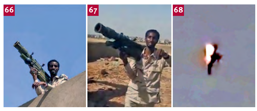
Images 66–68 RSF fighter with Igla MANPADS allegedly bringing down a plane, 2023

Notes: An RSF member holding an Igla MANPADS (66, 67) after allegedly firing and bringing down a Sudanese military fighter plane (68).