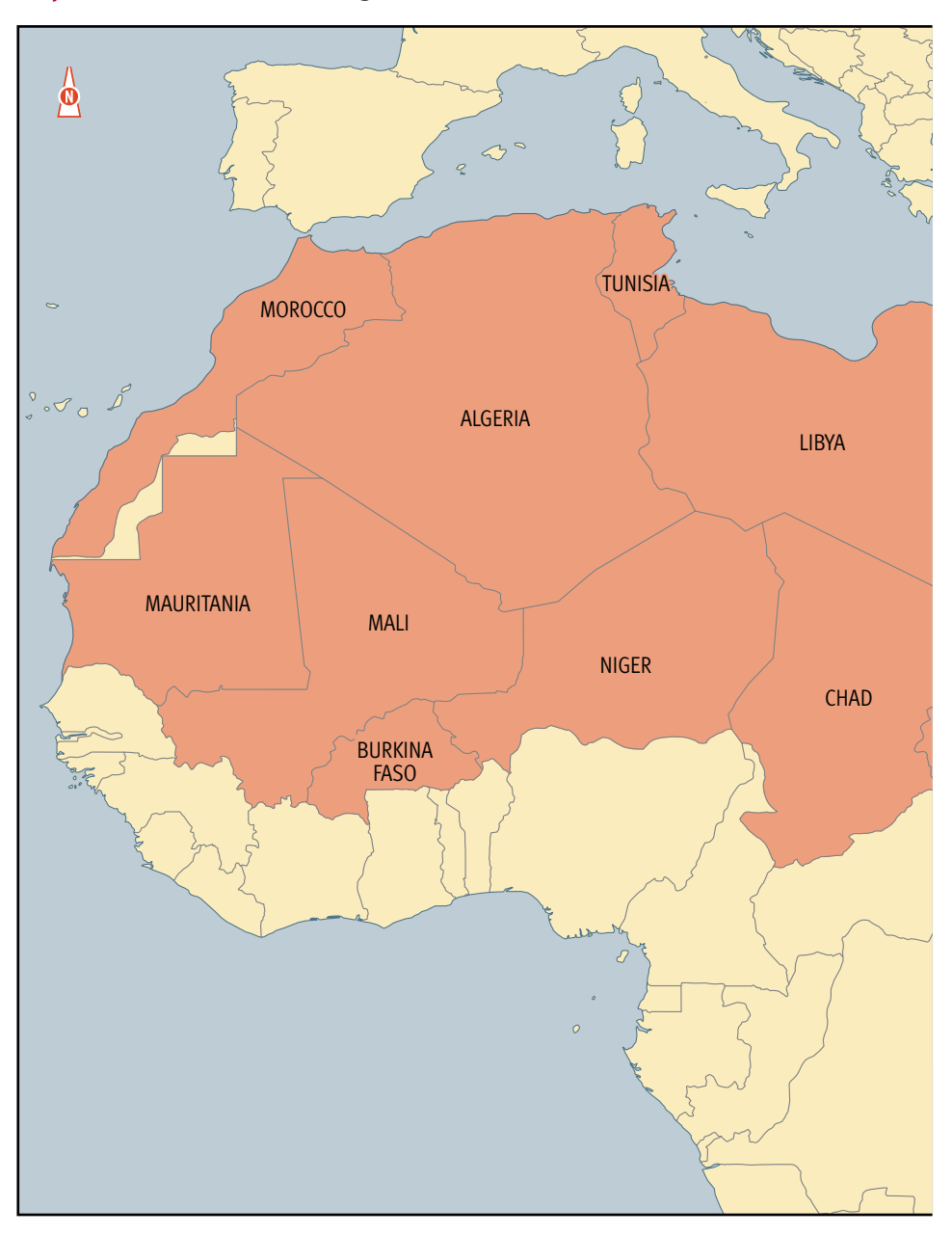
Map 1 Overview of the MENA region