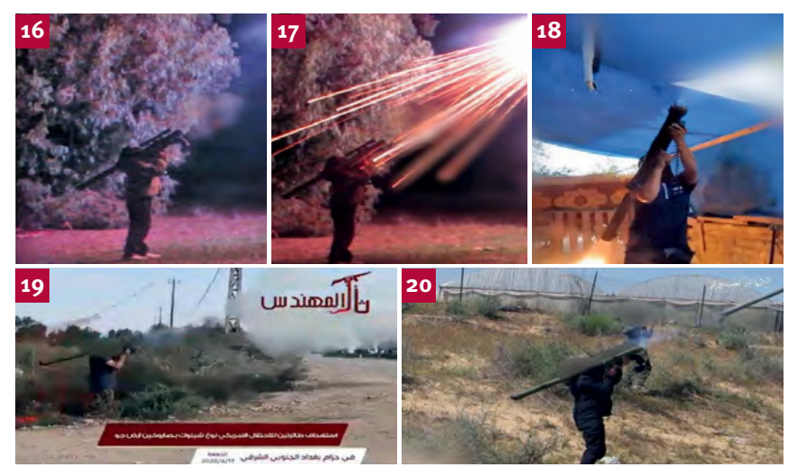
Images 16–20 Launches of Strela-2-pattern MANPADS in Iraq and Gaza, 2020–23

Notes: Launches of Strela-2-pattern MANPADS by the Ezzedeen al-Qassam Brigades (the military wing of Hamas) (16, 17) and al-Quds Brigades (18) in 2022, by the Revenge of Muhandis Brigade in Iraq in 2020 (19), and by the Ezzedeen al-Qassam Brigades in 2023 (20).