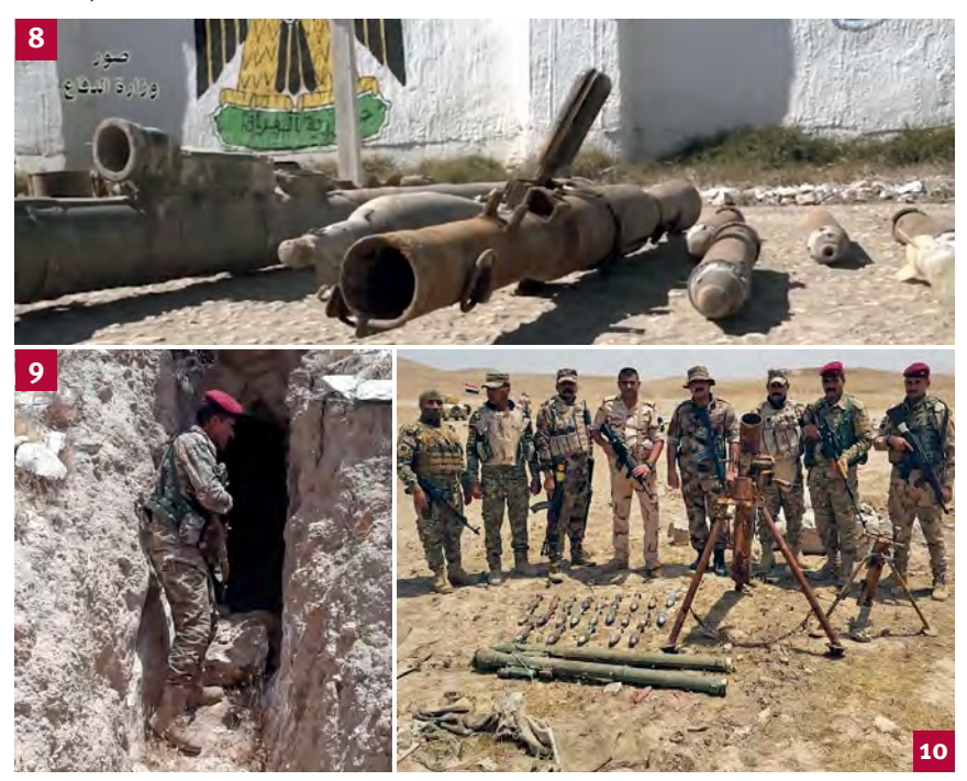
Images 8–10 Strela-2-pattern MANPADS components found in arms caches in Iraq, 2017 and 2019

Notes: Strela-2-pattern MANPADS launch tube found with rusted weapons in Iraq, 2017 (8); arms cache containing two Strela-2-pattern launch tubes found in a cave near Mosul, Iraq, 2019 (9, 10).