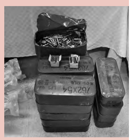
Ammunition seized in the neighbourhood of Mnihla, 2013.