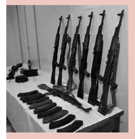
Weapons seized in the neighbourhood of Mnihla, 2013.