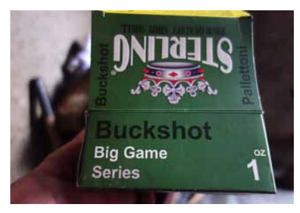
Photo 35 Cardboard packaging originally containing Turkish shotshells produced by Turaç Dıs, Ticaret Ltd. Şti. under its 'Sterling' brand.