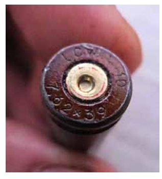
Photo 18 Ukrainian 7.62 × 39 mm cartridge case produced in 2010 by Lugansk Cartridge Works.