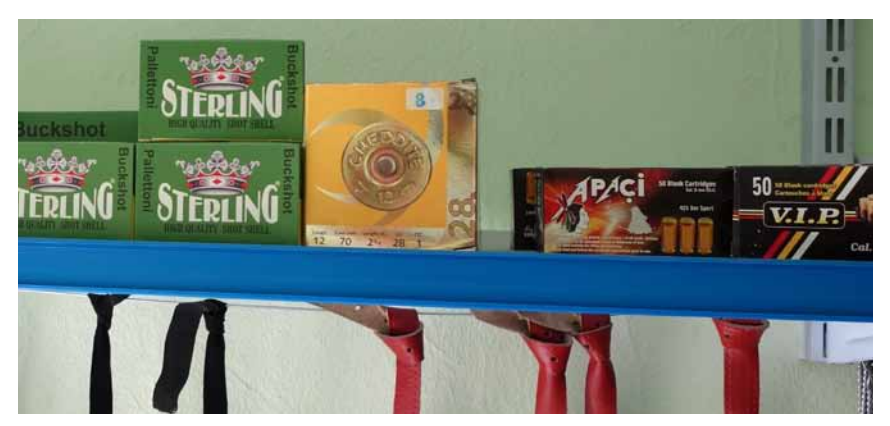
Photo 40 Turkish Apaci and V.I.P. brand 9 mm blanks (produced by Avrasya and Turan, respectively) displayed at a firearms and sporting goods store in al-Bab.