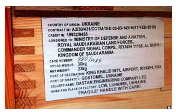
Photo 17 Wooden outer packaging containing 7.62× 39 mm cartridges produced at Lugansk Cartridge Works in Lugansk, Ukraine. Note contract date (17 February 2010) and consignee (Royal Saudi Arabian Land Forces).