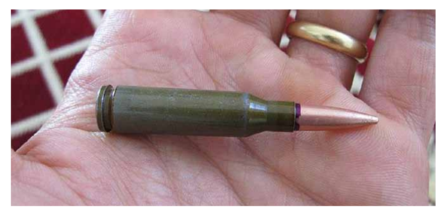
Photo 41 Russian 5.45 × 39 mm FMJ cartridge produced in 1998 by Barnaul Machine Tool Plant ISC.