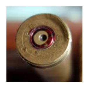
Photo 28 Soviet 12.7×108mm cartridge case produced in 1970 by the Novosibirsk Low Voltage Equipment Plant.

Although 12.7 × 108 mm ammunition is in widespread use in Syria, sources provided only four headstamps<sup>37</sup> and limited images of packaging.<sup>38</sup> This type of ammunition is used with DShKM, NSV, and W85 heavy machine guns, as well as later-model OSV-96 and Chinese M99 anti-materiel rifles (Jenzen-Jones, 2013). Video documentation of several wooden crates of 12.7×108 mm ammunition indicated the presence of B-32 API (armour-piercing incendiary) and BZT API-T (armour-piercing incendiary tracer) cartridges produced