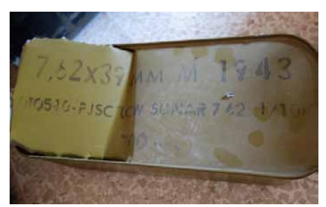
Photo 16 Sheet metal inner packaging containing 7.62 × 39 mm cartridges produced at Lugansk Cartridge Works in Lugansk, Ukraine. Note production date (2010).

Romanian armour-piercing incendiary (API) cartridges, produced at Uzina Mecanică Sadu S.A. in 1992 and 1996, were documented by sources in Aleppo.<sup>20</sup> These had lacquered steel cases, projectiles of two-piece construction (with a brass tip and GMCS lower jacket), and translucent red sealant at both the case mouth and covering the entire exposed portion of the primer and primer annulus. They featured the black-over-red tip markings common to most Eastern Bloc API cartridges. An unmarked 7.62 × 39 mm cartridge, bearing features consistent with Romanian (Sadu) manufacture, was also documented.<sup>21</sup> The cartridge was produced in 2012 and appeared to be of Romanian origin, or produced on Romanian-made machinery. This