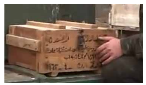
Photo 23 Wooden outer packaging, likely of Syrian origin, containing 7.62×54R mm cartridges produced in 1963.