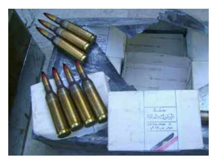
Photo 34 Iragi 14.5 × 114 mm armour-piercing incendiary (API) cartridges produced by the Al Yarmouk State Establishment.