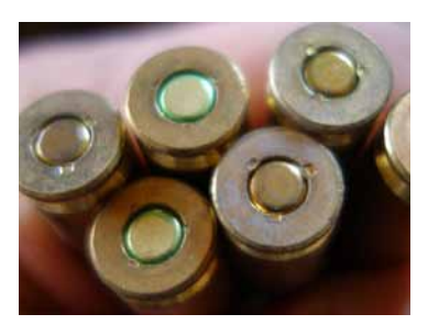
Photo 24 Unmarked 7.62×51 mm cartridges observed in Idlib, in September 2012.