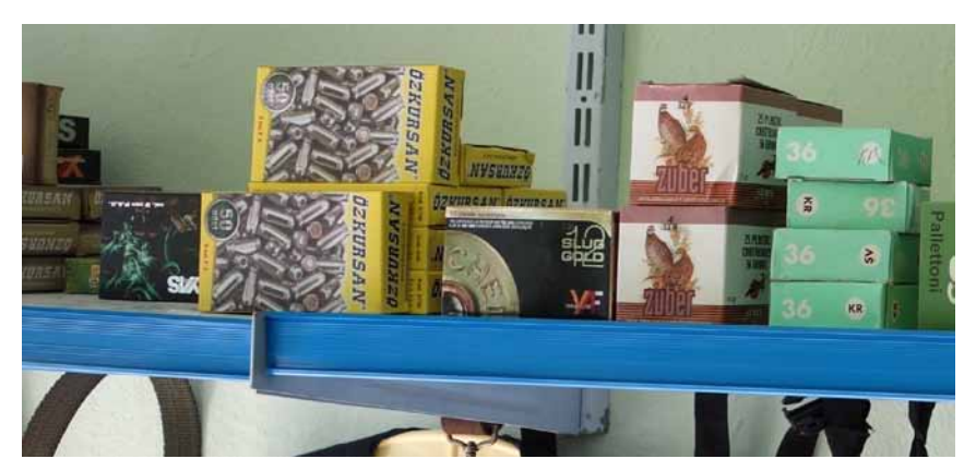
Photo 37 A range of shotshells and blank ammunition for handguns displayed at a firearms and sporting goods store in al-Bab.

Finally, sources noted another unidentified shotshell. One example was documented in Ibleen, in September 2012. This shell featured a blue plastic hull with faded white-printed markings, a brass case head, and indications of a petal-crimped closure.