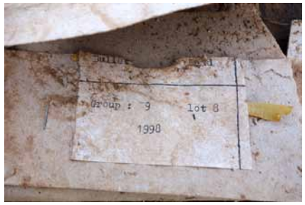
Photo 6/7 Cardboard inner packaging of Syrian origin, originally containing 50 7.62 × 39 mm cartridges produced in 1998. [Confidential source]