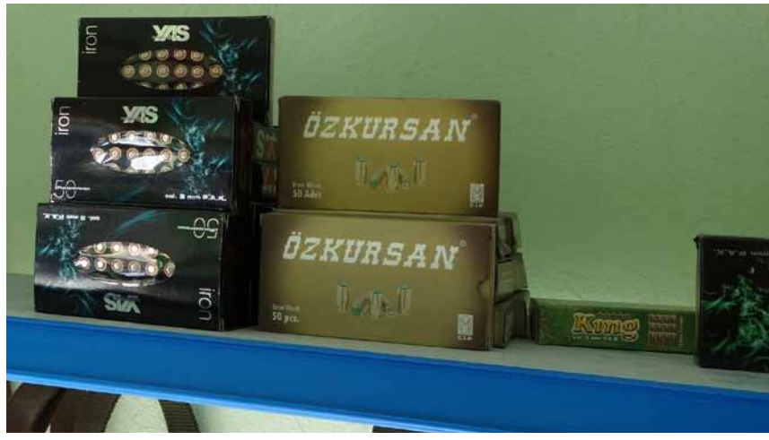
Photo 39 Özkursan, YAS 'Iron', and King brand 8 mm blanks (produced by Özkursan, Yavasçalar, and Çífsan, respectively) displayed at a firearms and sporting goods store in al-Bab.