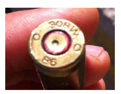
Photo 26 Czechoslovakian .308 Winchester cartridge case produced in 1986 by Sellier & Bellot.