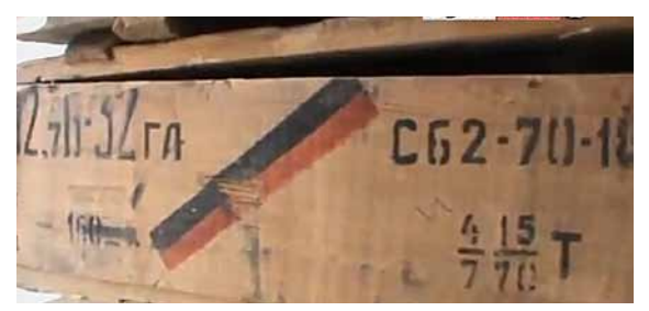
Photo 29 Wooden outer packaging containing 160 12.7× 108 mm B-32 armour-piercing incendiary (API) cartridges produced in 1970 by the Novosibirsk Low Voltage Equipment Plant.