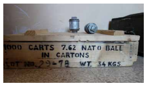
Photo 25 Wooden outer packaging containing 1,000 7.62×51 mm cartridges, associated with the ammunition seen in Photo 24.