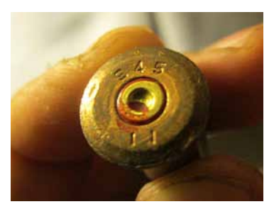
Photo 22 Chinese 7.62×54Rmm cartridge case produced in 2011 by State Factory 945.