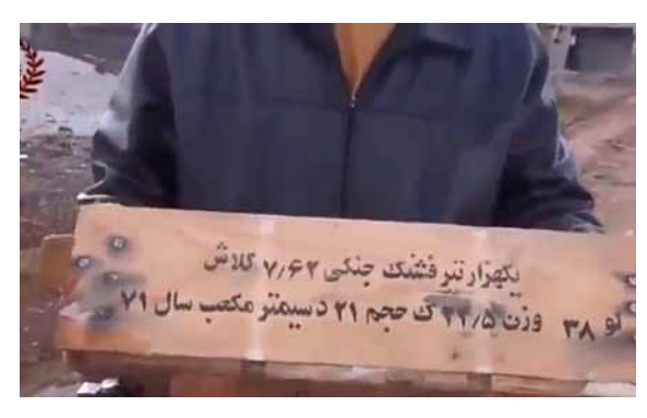
Photo 5 Wooden outer packaging of Iranian origin, containing 1,000 7.62 × 39 mm cartridges produced in 1992

There are several complicating factors that make it hard to distinguish between Iranian and Syrian ammunition (see below). Headstamps featuring '6 6' and '7 7' configurations are most difficult to identify conclusively and expert opinions on the matter vary. According to some small arms ammunition specialists, such cartridges may be either distinctly Iranian or distinctly