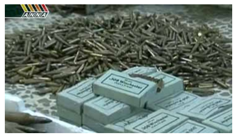
Photo 27 Cardboard inner packaging containing .308 Winchester cartridges.