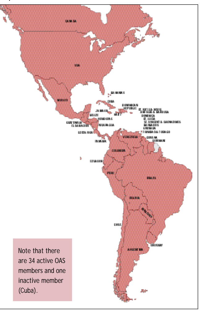
Map 7.1 OAS Member States

norms, specifically obliging States Parties to criminalize illicit arms manufacturing and trafficking (art. IV), and provides for mutual legal assistance (art. XVII) and extradition rights (art. XIX).