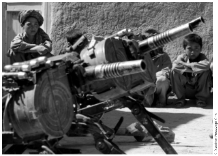
Afghan children squat next to grenade launchers handed in by local villagers to the UN as part of a voluntary weapons collection effort.

Other regions still remain virtual blank spots on the map of global stockpiles. China is an especially important, and potentially very large, unknown. Virtually no hard data is available on the Middle East, with the exception of Israel and Jordan.