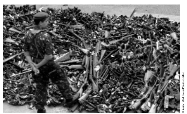
A Brazilian soldier guards a mountain of confiscated firearms to be destroyed by the government of Rio de Janeiro.

Continuous research has gradually improved knowledge about global small arms stockpiles. Global stockpiles, estimated last year to number at least 639 million small arms, continue to grow steadily. Regional dynamics can be very different. This chapter shows that some regions previously thought to have few small arms actually have large quantities in public hands. Other regions widely assumed to hold a lot actually have relatively few.