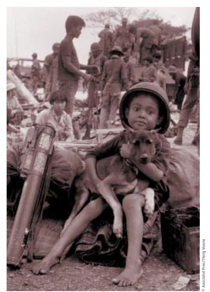
A Cambodian boy and his dog await the boy's father at an army camp.

Indicators of the effects of small arms misuse on social capital include child soldiers, membership of armed gangs, repeated criminal activity, a surge in the incidence of domestic violence, and the breakdown of customary authority. Other indicators pertaining to the quality of community life reflect deteriorations in: neighbourhood relations; family-based networks; occupation-based help groups; rotating savings and credit groups; membership of civic associations; and the number of people walking the streets at night. The presence and threat of small arms can also affect people's involvement in political activities, especially elections and political rallies.<sup>47</sup>