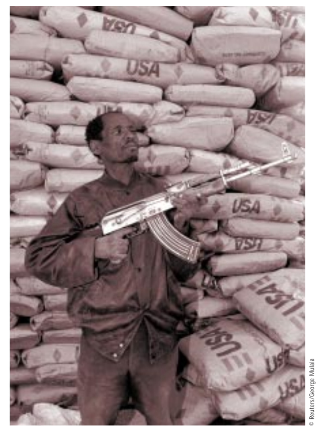
An Ethiopian guard protects food stored in a warehouse.

The degree of insecurity in some regions has increased to the extent that even security assessments themselves are perilous. In September 2000, security officers in Somalia, who were administering security assessments to deter-