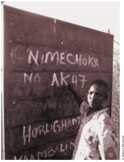
'No more AK-47s,' painted on a wall by the women of a village in Kenva.

Unlike fatal and non-fatal injuries, the indirect effects of small arms availability and misuse often go unnoticed. Indirect effects are also difficult to disaggregate because they are often interrelated with other factors. For example, firearms-related crime in rural communities can increase the costs of productive activities, distort household consumption patterns, and generate food insecurity. Food scarcity can then contribute to domestic and communal violence. Likewise, firearms-related deaths and armed intimidation can lead to forced displacement, which in turn overwhelms service-providers in areas of temporary settlement. Unequal access to basic services can ignite conflict between displaced and host communities. Communal tensions of this kind have led in several publicized instances (not to mention numerous unreported cases) to the excessive use of force by police and public security forces.