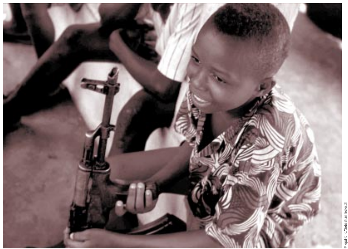
A child soldier in Sierra Leone.