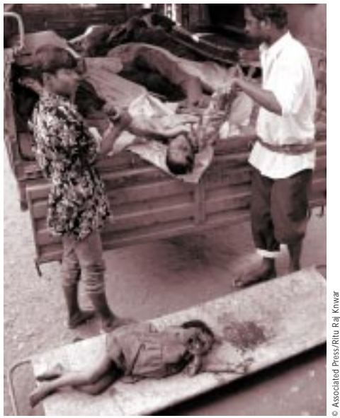
Children killed in separatist violence, northeast India.

Armed criminality is particularly virulent in societies emerging from conflict and where small arms are widely available. According to media reports, Cambodia's capital, Phnom Penh, experiences an armed robbery rate four times higher than that of Bangkok, and is considered one of the more dangerous capitals in Southeast Asia. A recent survey of 783 households in Phnom Penh revealed that more than 60 per cent of respondents had experienced theft in the previous year, mostly carried out by armed gangs.<sup>26</sup> Recent studies from Mindanao, the Philippines, demonstrated that more than 85 per cent of all external deaths in 2000 were attributable to small arms injuries. The same report claims that 78 per cent of all reported violent deaths and injuries resulting from criminal acts were committed with military-style automatic weapons and handguns (Oxfam-GB, 2001b). Even in Sudan, racked by