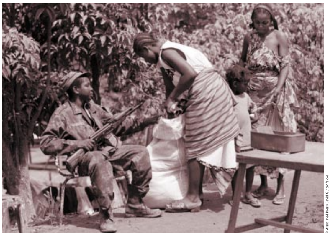
Rebel fighters inspect the belongings of refugees returning to Brazzaville.

Armed violence can also affect food production, which may need years to recover after fields have been left fallow. As with anti-personnel landmines, a legacy of small arms availability can undermine a community's willingness to engage in subsistence farming or the desire of firms to invest in agriculture or other productive activities. In Sierra Leone, for example, the country's GDP has collapsed as a result of declines in the value-added product of agriculture and industry (World Bank, 2002b). The proportion of value-added product contributed by agriculture to GDP contracted in Angola, from a peak of 23 per cent in 1991 to an average of six per cent in the following eight years. During Mozambique's civil war, agro-industry exports suffered serious declines, falling in volume terms by more than 20 per cent between 1982 and 1992 (Goudie and Neyapti, 1999).