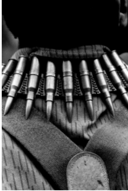
A necklace of bullets adorns a Rwandan rebel fighter.

Small arms availability and misuse has direct effects on human development that can be empirically measured and recorded. It constitutes one of the leading causes of fatal and non-fatal injury in many developing countries. The direct effects reach beyond victims' physical pain and anguish and extend to the costs of treatment and rehabilitation, the opportunity costs of long-term disabilities and the implications of lost productivity on households. In South Africa and Uganda, two countries where firearm injuries are one of the primary causes of death, a significant proportion of victims go into debt to pay medical expenses resulting from their firearm injuries. Moreover, the direct burden resulting from threat to life, combined with the indirect burden of protection and avoidance, constitute a tax on the standard of living of communities.