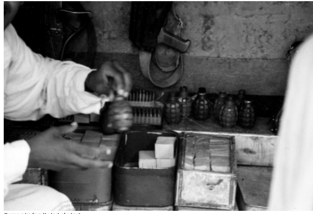
Weapon sales from the back of a truck.

The chapter suggests that there is a great need to more closely explore the role that weapons play in the life of different communities around the world. By understanding why people possess and use weapons as they do in different societies and cultures-what they use them for, what they signify, and what they communicate to their owners and to othersmatters of stockpiling, concepts of security, and the possibilities of reducing or controlling misuse come into better focus for policymakers. Such efforts will enable donors, implementing agencies and local community actors to devise more legitimate, sustainable, and useful programmes around the world.