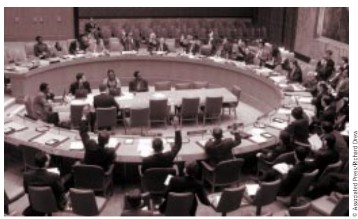
The UN Security Council votes unanimously to adopt Resolution 1343, re-imposing an arms embargo on Liberia because of its support for armed rebels in neighbouring Sierra Leone (7 March 2001).

States are thus bound, under existing international law, to refrain from transferring small arms and light weapons in situations that would involve, or lead to, a breach of established international rules such as those listed above. The Commission of Nobel Peace Laureates, assisted by a coalition of several NGOs, has sought to codify these obligations in the form of a Framework Convention on International Arms Transfers