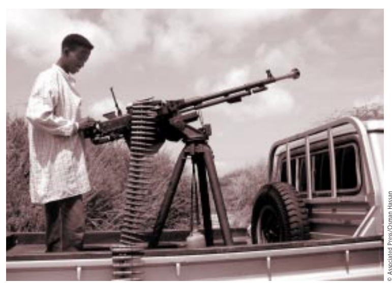
A young Somali prepares to test fire an anti-aircraft gun at a Mogadishu gun market, as states meet in New York on the first day of the UN Small Arms Conference.

Stability. In October-November 2000, during the 55th session of the First Committee, 32 statements out of 78 (41 per cent) cited small arms as a threat to stability. During the UN Conference, 73 of 134 did the same (54.5 per cent). While stressing that illicit small arms were not the cause of conflict, many states pointed out that these weapons aggravate, escalate, and/or perpetuate conflict, and also make the post-conflict