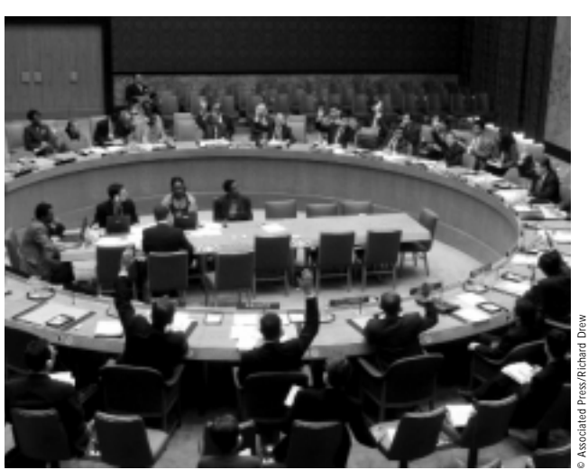
The UN Security Council votes unanimously to adopt Resolution 1343, re-imposing an arms embargo on Liberia because of its support for armed rebels in neighbouring Sierra Leone (7 March 2001).

A norm for the destruction of unwanted weaponry, though less well entrenched, also appears to be taking hold in southern Africa. Subregional cooperation, though quite extensive as a result of existing mechanisms, has not yet extended to small arms, though the potential for this appears strong as efforts to implement the SADC Protocol gather steam.