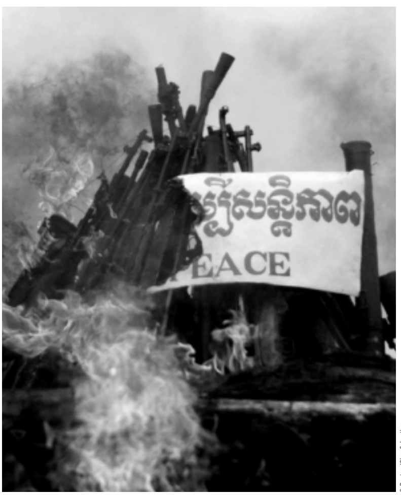
Nearly 7,000 small arms are burned in Cambodia to mark the beginning of the UN Small Arms Conference (9 July 2001)

The word 'norm' frequently accompanies discussions surrounding the UN Small Arms Conference process. While some observers claim the UN Conference Programme of Action gives concrete expression to a range of small arms norms, others deny the instrument's relevance to international efforts in this area.