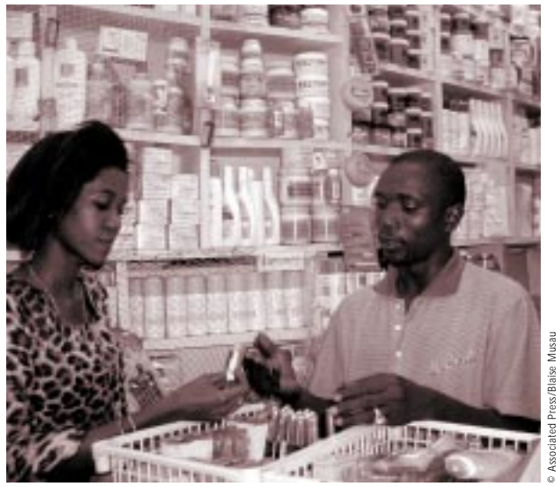
After handing in weapons, ex-combatants used small loans to create innovative small businesses, such as this cosmetics shop in Brazzaville.

The cease-fire, signed in November and December 1999 by the main belligerents, comprised a number of provisions. These included the disarmament and demobilization of militias, their reintegration into the armed forces, Police nationale, and Gendarmerie, and the convocation of a so-called National Dialogue on the constitutional and political future of the country. The CDS was charged with overseeing the implementation of the immediate provisions, notably disarmament and demobilization, and completed its work in late 2000. The National Dialogue, which was held in April 2001, established a timetable for elections.