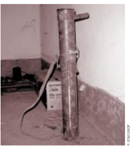
The Shmel, using fuel-air explosives, poses a significant danger in the RoC, as it continues to circulate after fighting has stopped.

The combination of 'spontaneous recruitment' with the lack of control over combatants makes it impossible to estimate militia size precisely.