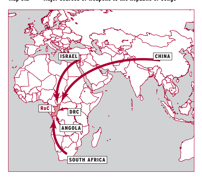
Map 8.2 Major sources of weapons to the Republic of Congo

Denis Sassou Nguesso purchased weapons in 1997 at two critical junctures in the conflict. At the outbreak of the conflict, Cobra combatants managed to intercept a shipment of Bulgarian-made AKS-47s in Kinshasa destined for the Congolese government or UNITA forces in Angola.<sup>27</sup> These weapons were purchased from the intermediaries organizing the shipment and transported by pirogue to the district of Mpila in Brazzaville. There they were stockpiled in the homes of pro-Sassou officers.<sup>28</sup> In addition, Cobra forces received at least two major shipments of heavy and light weapons, armoured vehicles, and ammunition from Angola and Gabon in September 1997. The former were