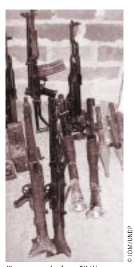
Weapons cache from Sibiti.

The ex-combatants that make up the Cocoye live primarily in the regions of Bouenza, Lekoumou, and Niari, and throughout the southern and western districts of Brazzaville. The distribution of weapons among Cocoye ex-combatants is more varied than that of the Cobras due to the relative cohesion of the militias in the 1997 and 1998–99 conflicts. In 1997, the Cocoye were organized as a paramilitary formation dependent on the presidency for weapons and orders, while in 1998–99 its transformation into a typical guerrilla movement imposed a classic cell structure on organization and operations. Survey results, key informant interviews, and inspections of caches reveal that in Bouenza, Lekoumou, and Niari, weapons distribution patterns consist of a variety of cache sizes ranging from small individual to large collective holdings. There is an uneven distribution of weapons among ex-combatants: 14 per cent possess a single weapon, 46 per cent between two and five weapons, and a further 22 per cent own 11 or more weapons. Assault rifles—AK47s, Galils, and Vector R4/R5s—are the most common weapon types, along with RPGs.