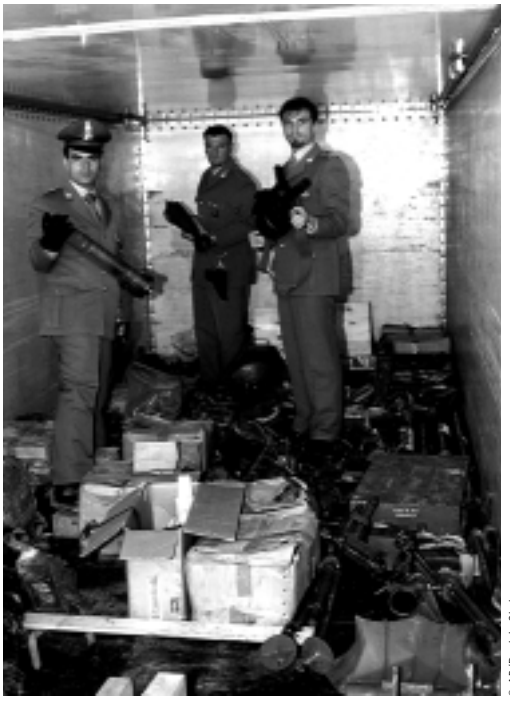
Italian customs police find weapons in a truck whose manifest said it contained humanitarian aid for Kosovo refugees in April 1999.

The line between licit and illicit brokering activities is frequently blurred. In principle, legal brokering takes place with governmental authorization, which, in turn, should be given in accordance with national and international norms. In practice, given that very few countries have in place a system of authorization of brokering activities, brokers find themselves in a 'grey zone' in which their actions are effectively unregulated. Although brokering an arms deal to an embargoed country is clearly in violation of international legal provisions, much brokering activity that is suspect may not be as unequivocally illegal.