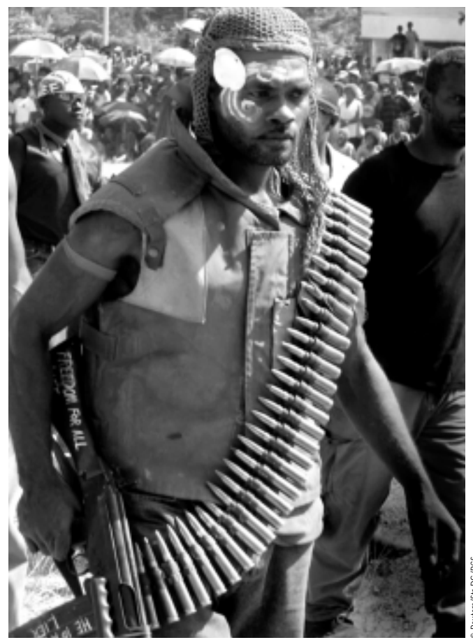
A former member of the Malaitan Eagle Force carries his gun after the group agreed to surrender their weapons in the Solomon Islands in August 2003.

Pacific nations are no strangers to small arms. During the Second World War, island states in the region were home to thousands of armed troops and suffered many bloody conflicts. More recently, small arms have reappeared as vectors of death and injury in the Solomon Islands, Papua New Guinea, Fiji, and even Australia.