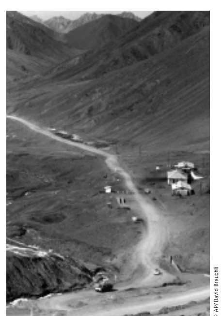
This remote Kyrgyz checkpoint at Kyzyl-Art poses a feeble threat to traffickers who navigate the windy road into and out of neighbouring Tajikstan.

While there appear to be no substantial arms flows, Kyrgyzstan is home to a number of arms caches, which are a cause for concern. Most caches were probably installed by activists from the Islamic Movement of Uzbekistan (IMU), who entered Kyrgyz territory in 1999.