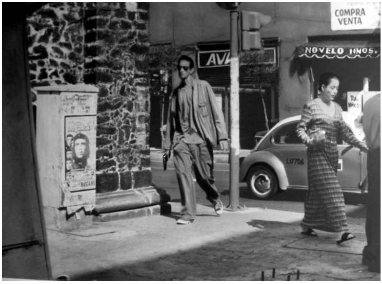
Francis Alÿs, Re-enactments , 2000 Still of video installation

Today, public television networks and channels such as CNN and Sky News compete to show the most explicit images of breaking news stories. In the manner of reality TV, they actively broadcast real gun violence, including kidnap videos showing hostages sur-