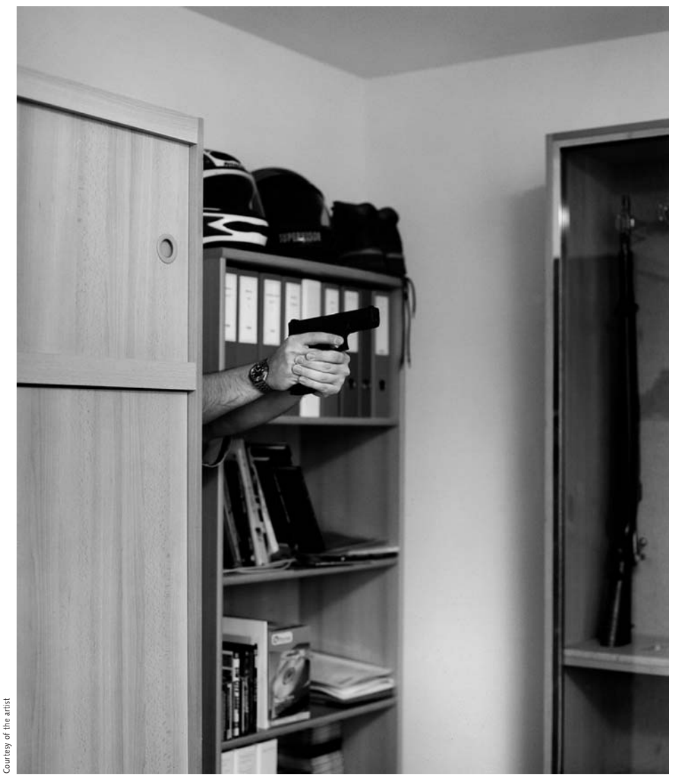
Peter Tillessen, Friendly Fire , 2003 C-print, 40 cm x 50 cm

What defines the relationship of gunowners to their weapons? In his series Friendly Fire , German photographer Peter Tillessen steps into gun collectors' homes to capture them with their weapons. Yet the images do not reveal the owners' faces; their anonymity may well reflect a lack of social acceptance of gun collection today. The weapons themselves display a streamlined design and functional simplicity not unlike those of the apartment furnishings. The viewer must get a sense of the owner's relationship to the gun from the body language rather than a facial expression. The gun conveys an extraordinary sense of power and violence within these ordinary settings.