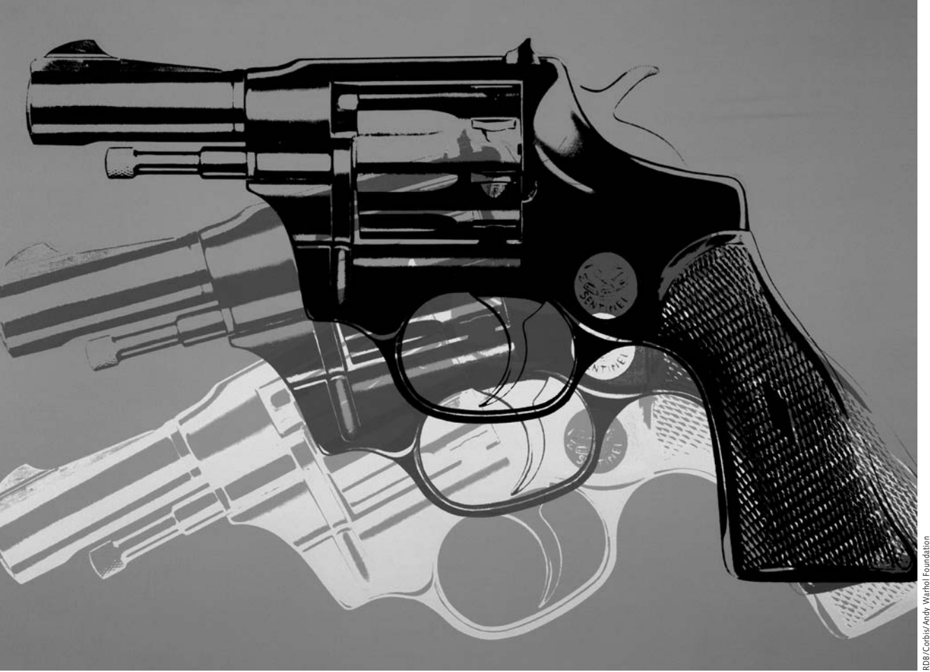
Andy Warhol, Gun , 1981–82 Synthetic polymer paint and silkscreen ink on canvas

Contemporary artists have generated a wide-ranging body of work in which small arms feature prominently. Using a variety of media and approaches—whether paint, video, photography, sculpture, or mixed-media techniques—these artists consider the role of guns in areas as diverse as the media, video games, arms production, the arms trade, and politics. This brief overview presents a selection of their work.