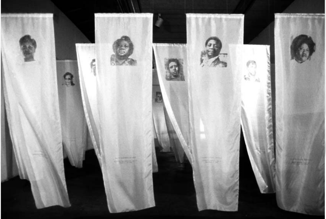
Bradley McCallum, Shroud: Mothers' Voices , 1992 Silk with photo images, text, and video interviews

In Shroud: Mothers' Voices (1992), another US artist, Bradley McCallum , concentrates on the mothers of gunshot victims. In this installation, white, shroud-like sheets hang from the ceiling of the exhibition space; each sheet features silk rubbings from photographs of the mothers of local gun victims. Accompanying videotaped interviews feature the same women talking about the children they lost and the people they blame for their deaths. Through this piece, McCallum gives a voice to the families of the victims of gun violence.