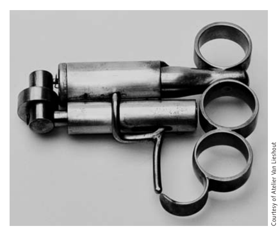
Atelier Van Lieshout, Pistolet poignée américaine , 1995 Steel and stainless steel; L: 12 cm, W: 11 cm, H: 2 cm