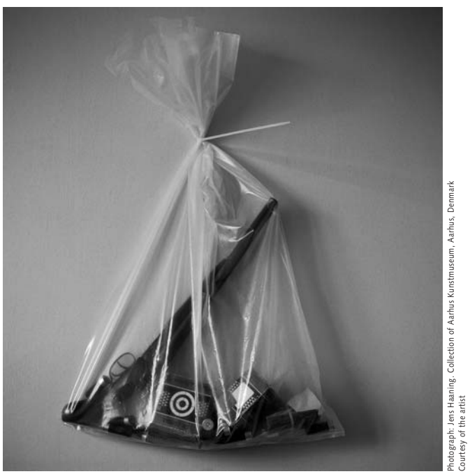
Jens Haaning, Sawn-off , 1993 Sawn-off shotgun with ammunition in plastic bag

what is acceptable in daily life. Similarly, for Weapon Production (1995), Haaning recruited immigrants to manufacture street weapons over a two-week period in a Copenhagen workshop; the space was then opened to the public.