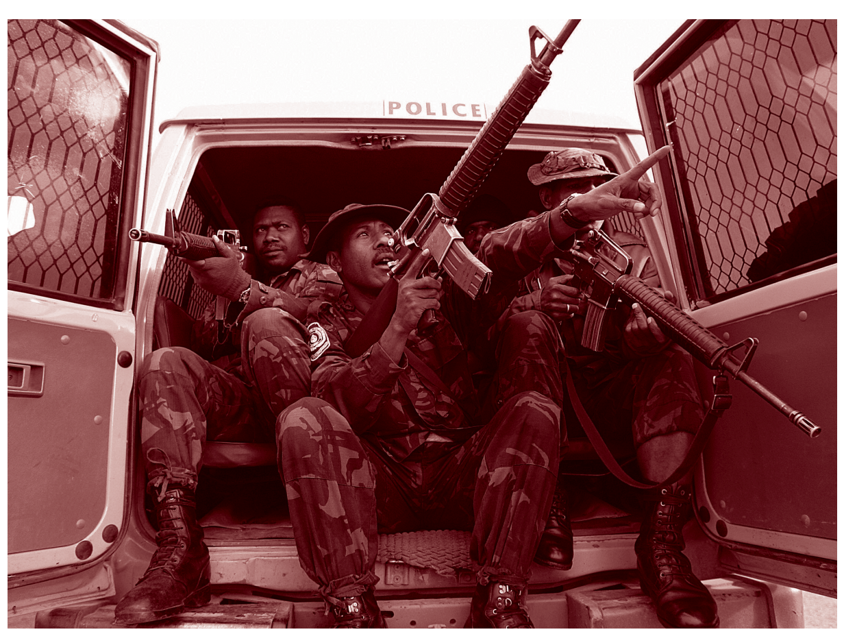
PNG police brandish M-16s as they patrol the streets for raskol gangs in August 2004.

Armed violence in Papua New Guinea is not evenly distributed, but rather concentrated in particular areas. In fact, Port Moresby—the country's fastest growing urban centre, with a population exceeding 300,000—now accounts for more than 30 per cent of all nationally reported crimes despite registering only 5 per cent of the country's population. Much of the crime is concentrated in Port Moresby's squatter settlements, where unemployment is high and service provision poor. The situation in the Southern Highlands, arguably Papua New Guinea's most troubled province, is equally disconcerting. There, the past decade has witnessed declining service delivery coupled with a dramatic upsurge in armed violence—coinciding for the most part with the advent of large-scale resource extraction activities.