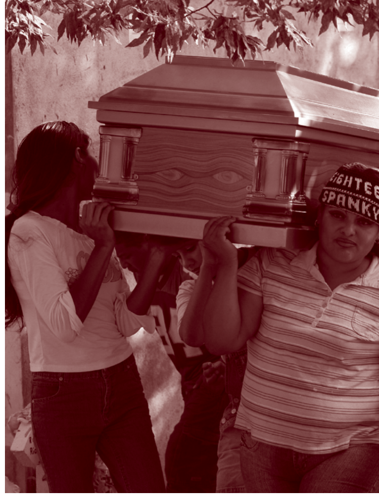
Friends carry the body of a female member of Pandilla-17, killed during clashes with rival gang members, San Salvador, February 2007.

Despite the accumulation of accounts of female agency and violence within gang