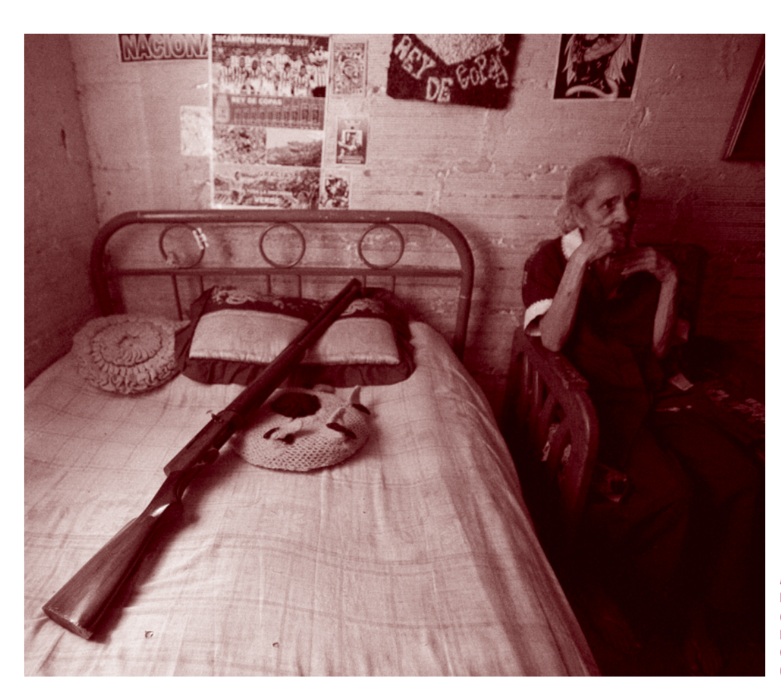
A 73-year-old woman hides weapons for local gang members in her home, Medellín, Colombia.

Female gang members who have 'masculine attributes' and who are actively involved in risky behaviour and committing offences are more vulnerable to attacks by rival gangs, including sexual violence, than females who do not partake in such behaviour (Miller, 1998, pp. 433-34). Operating on the front line, these girls may gain status within the gang but risk being victimized as a result and getting into conflict with the law. At the same time, however, these girls might be more protected from sexual abuse within the gang (Miller, 2002b, p. 93). Once victimized, girls may be blamed and labelled, which in turn increases the risk of repeat victimization within the gang—physical, sexual, emotional—by male and female members alike.