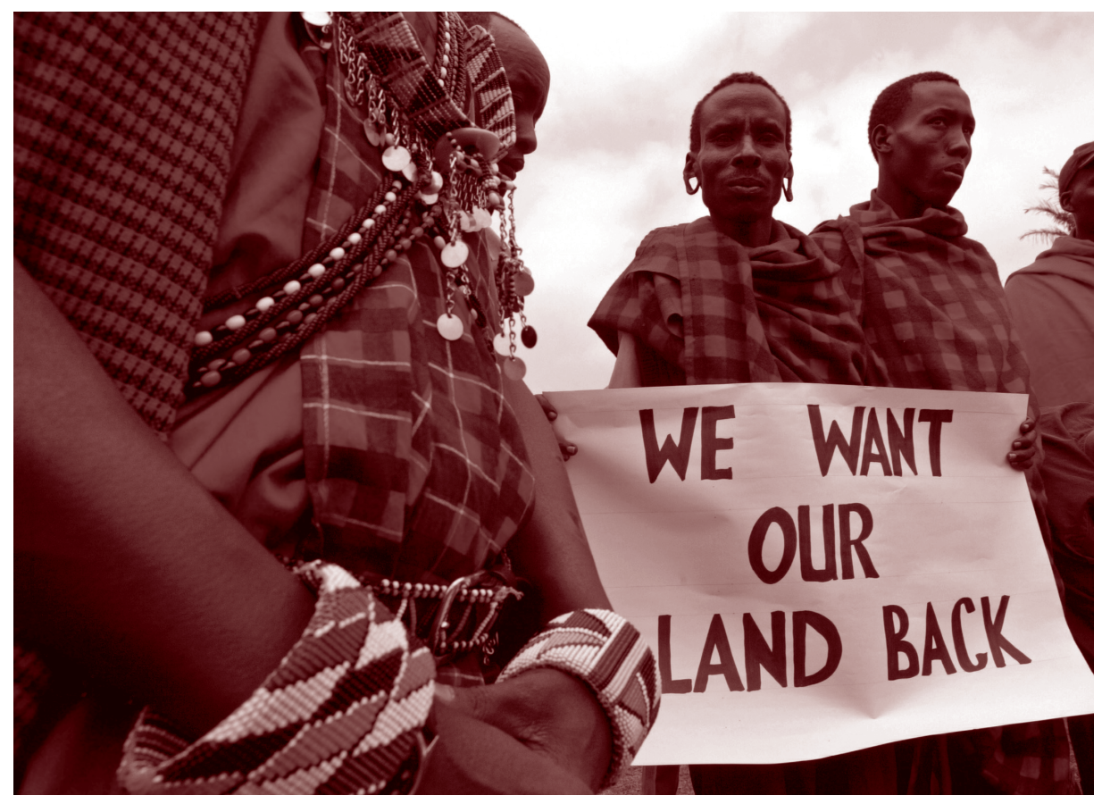
Maasai protesters demand that land leased to British settlers be given back to them, Uhuru Park, Nairobi, Kenya, August 2004.